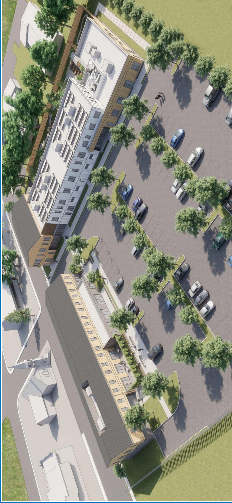
Rendering of the planned Clackamas County Recovery Campus