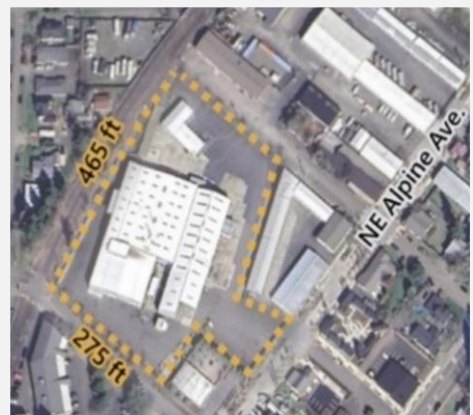
NE Gateway District Redevelopment – NW Rubber Site

The Urban Renewal Agency acquired this 3.5 acre industrial site to reposition to a developer for a mixed-use residential and commercial development.