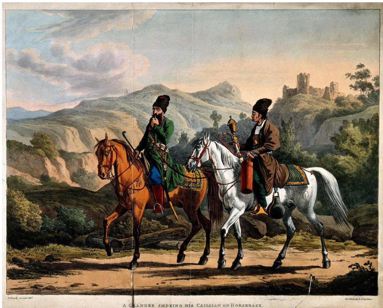
A GRANDER SMOKING HIS CAILLIAN ON HORSEBACK.