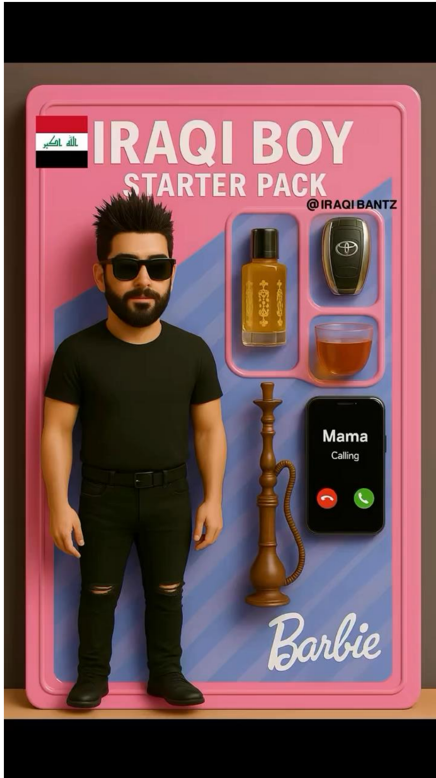
Instagram post by @iraqibantz with 24.7 thousand likes as of 5/21/25