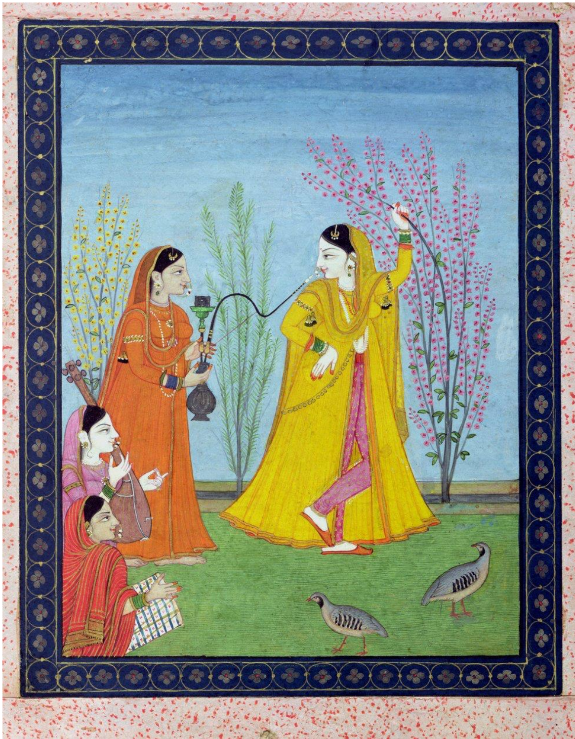
The Beginning of Spring, from Chamba, Himachal Pradesh, c. 1800