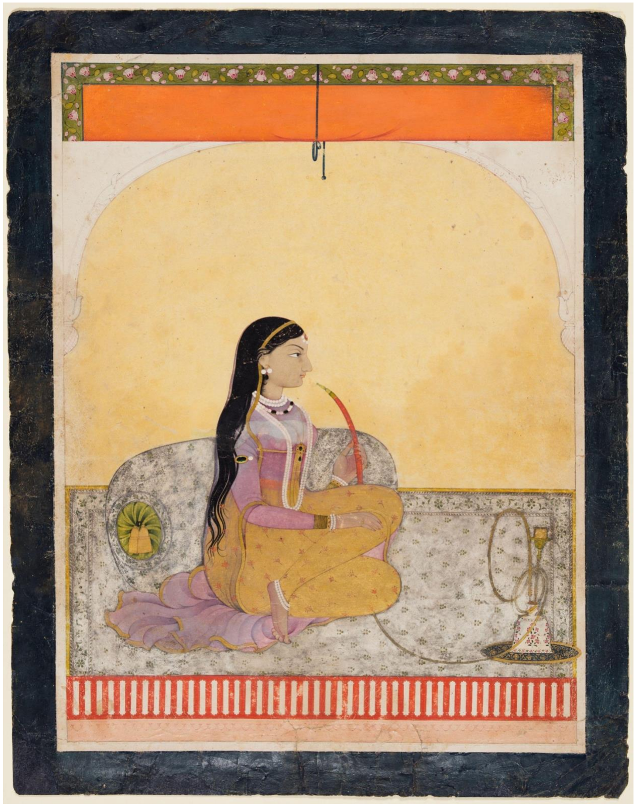
Northern India, Himachal Pradesh, Pahari Kingdom of Guler, Seated Lady Smoking, c 1780