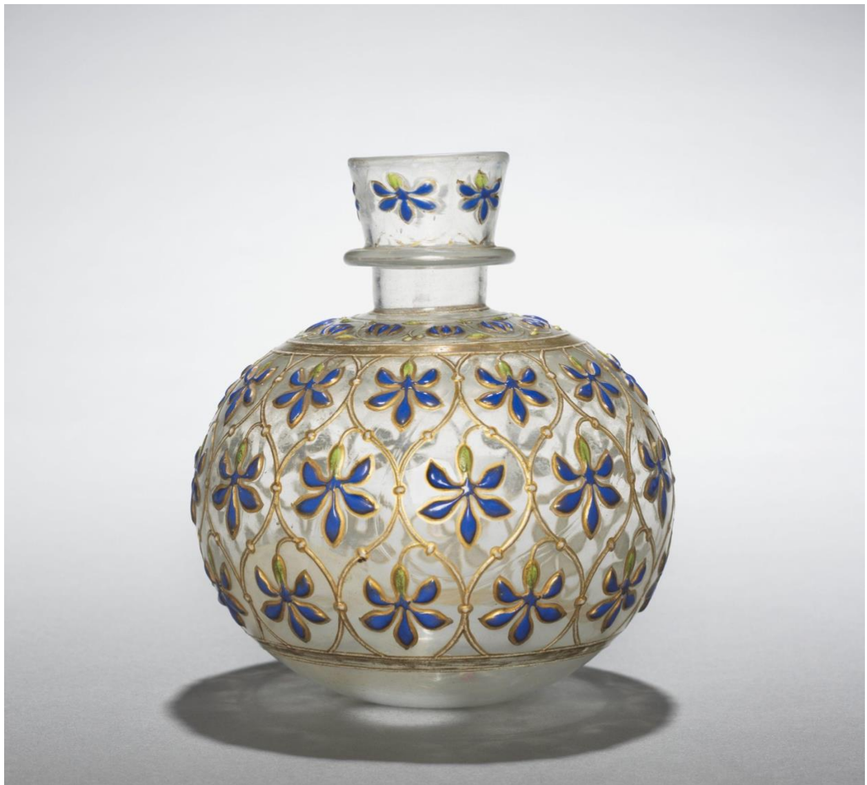
India, Mughal Dynasty (1526-1756), Hookah Base, early 1700s