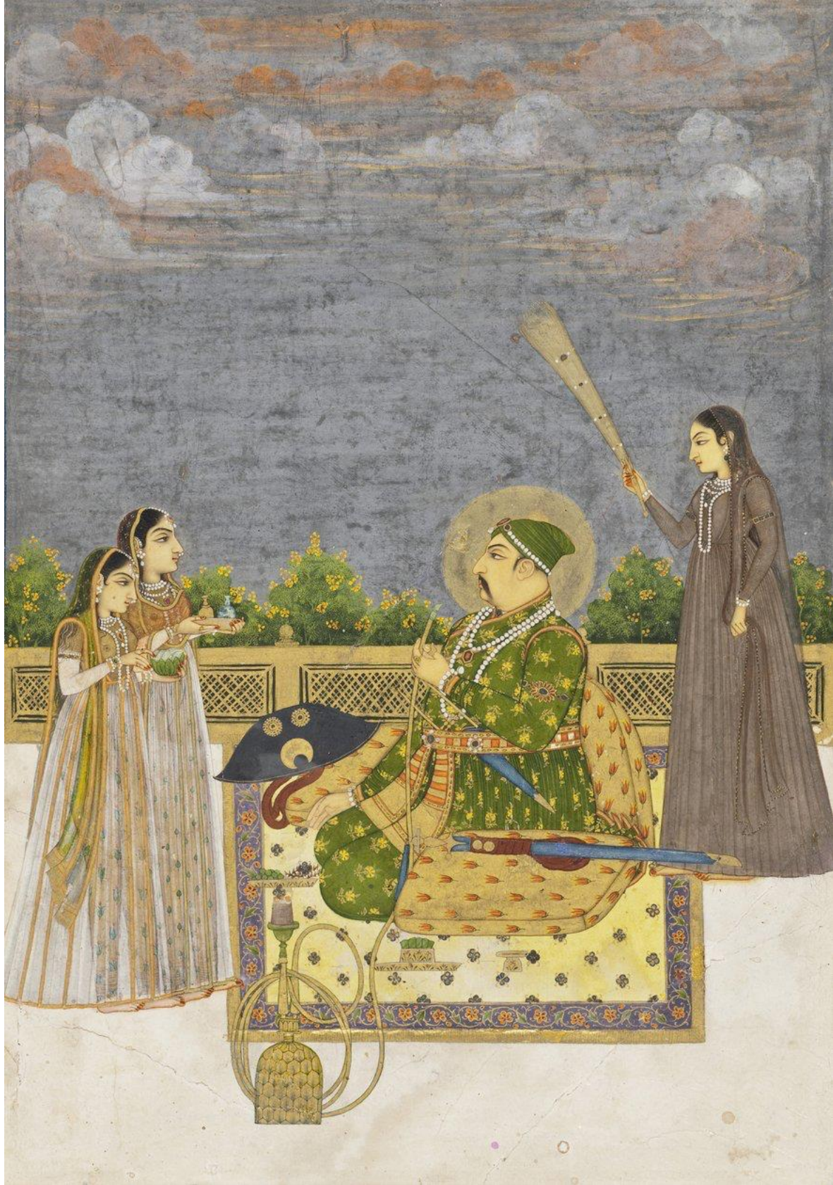
Emperor Muhammad Shah, c.1735