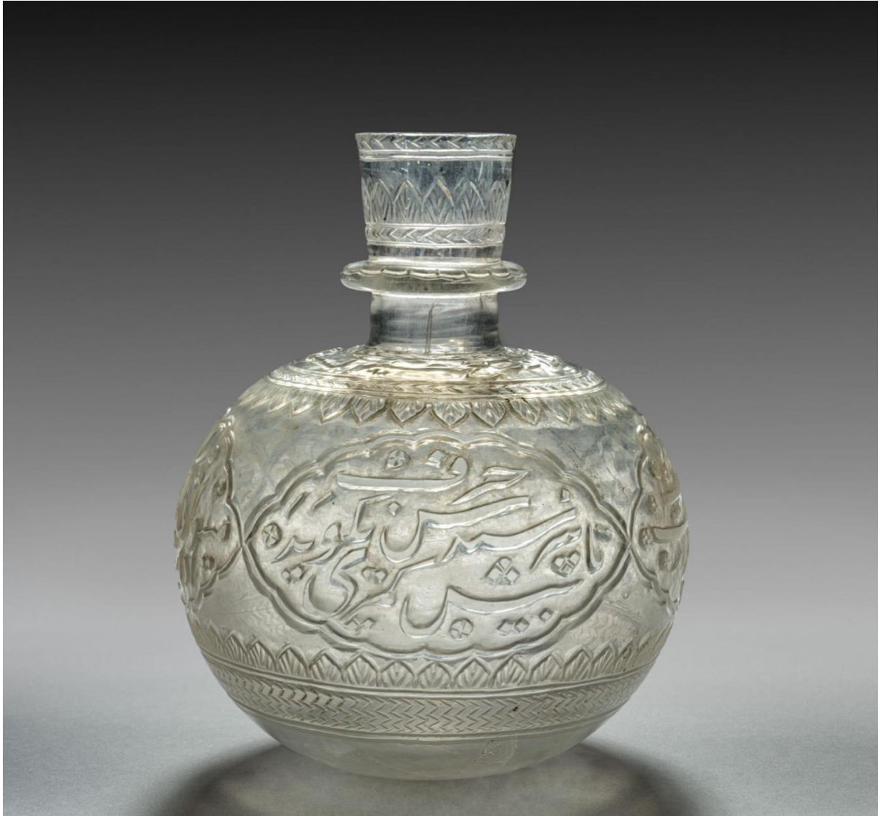
India, Mughal, Hookah Bowl, 1700s

Inscription in Farsi, on body: Even if live charcoal is placed on its head, the hookah, a teacher of etiquette, will not respond unless drawn upon; Thus one can learn from its manners of refinement.