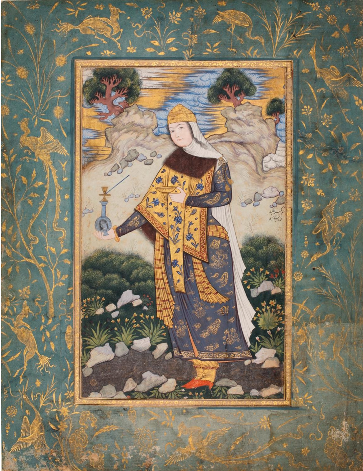
Isfahan, Iran | circa 1640–50