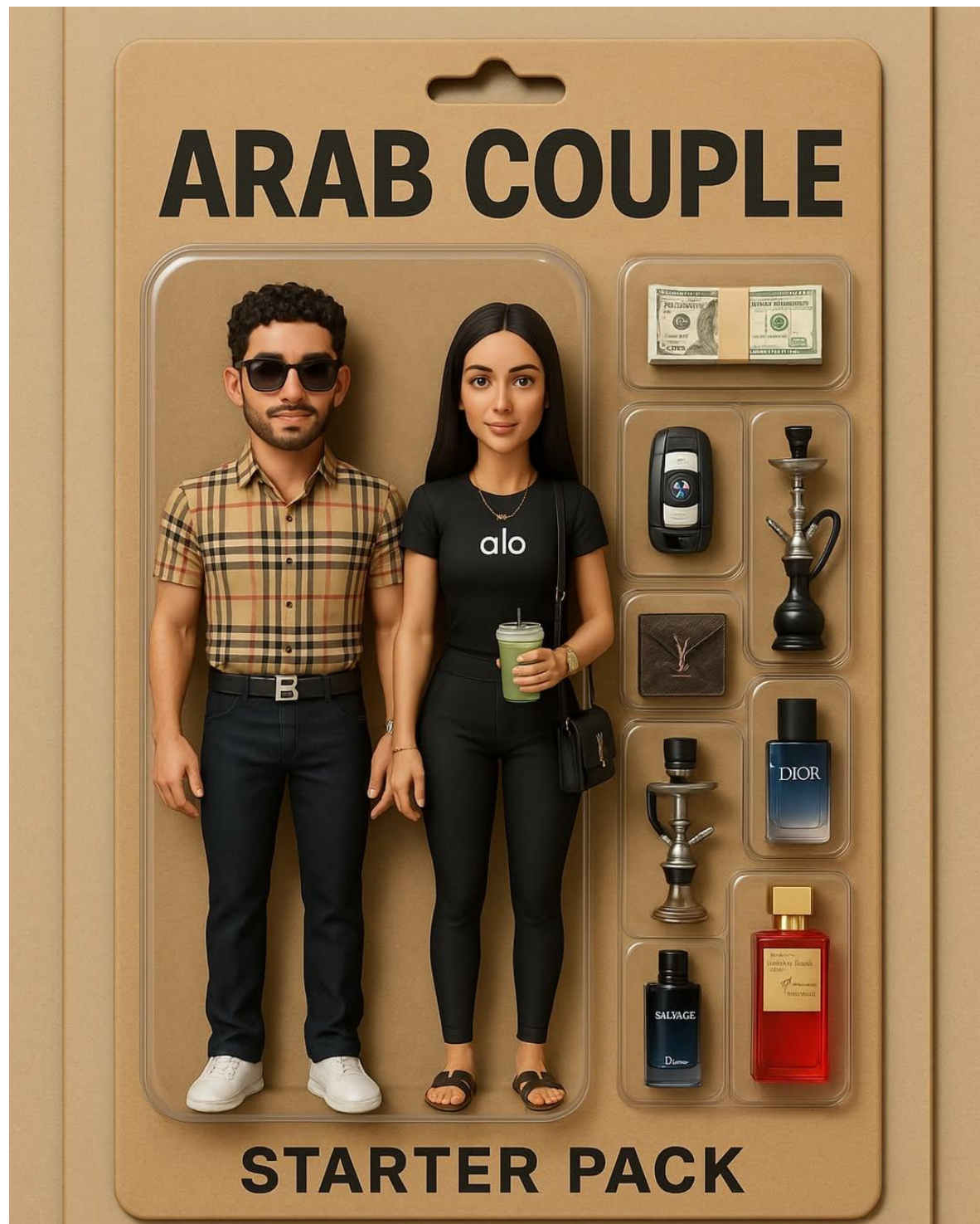
Instagram post by @arabysociety with 26 thousand likes as of 5/21/25