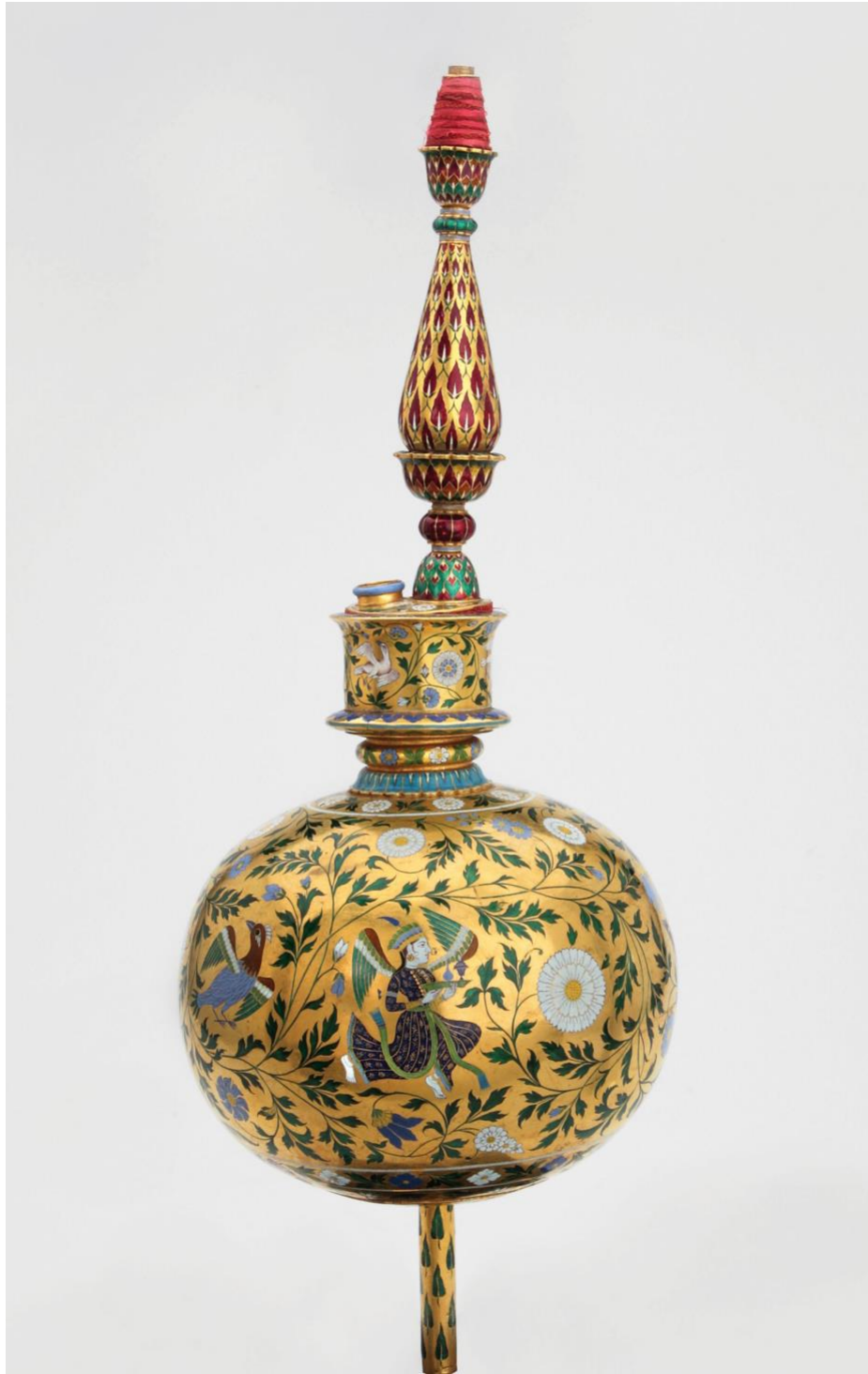
Hookah from Mewar (Rajasthan), India, circa 1700