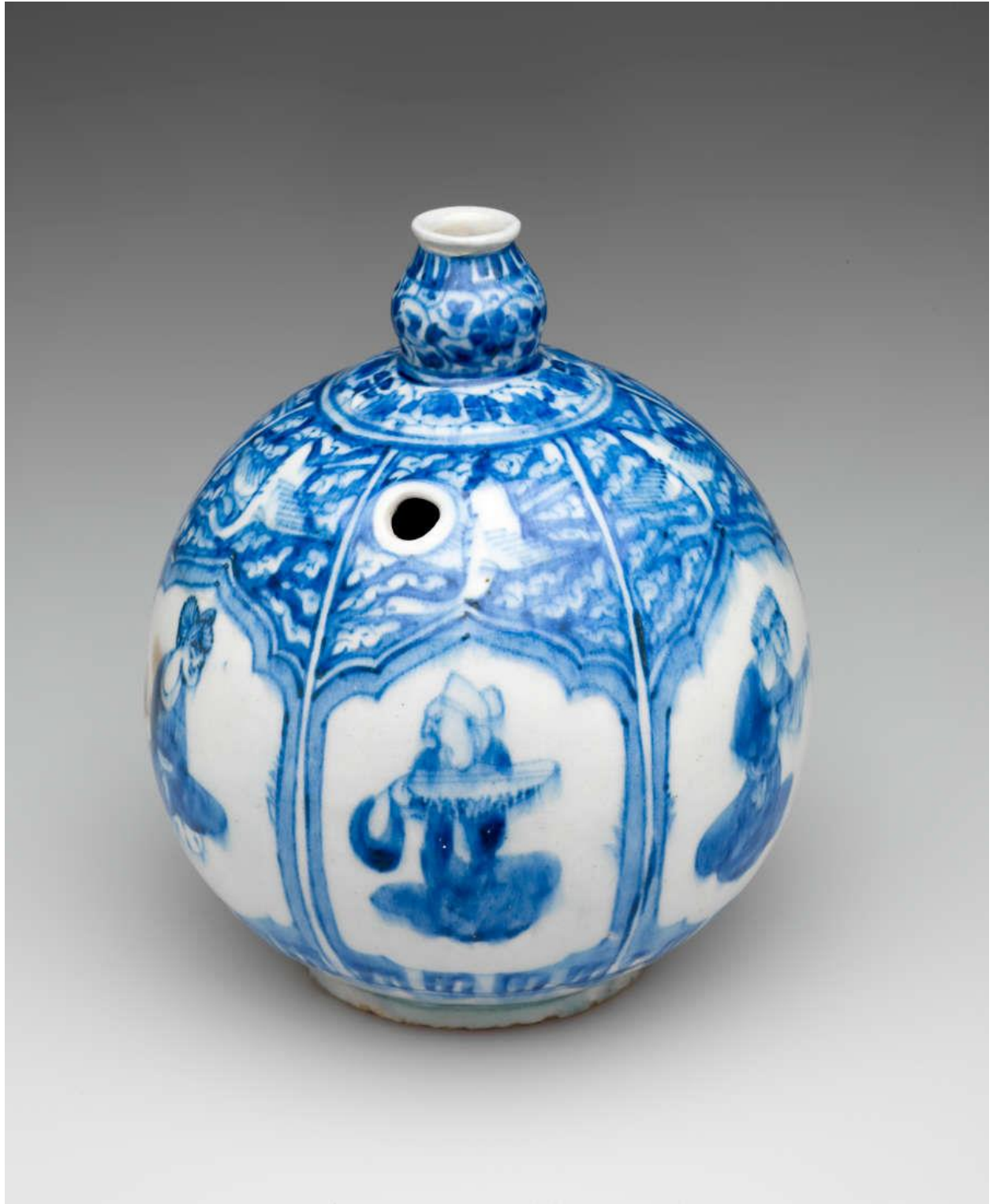
Hookah base, Iran, Safavid Dynasty, circa 1600