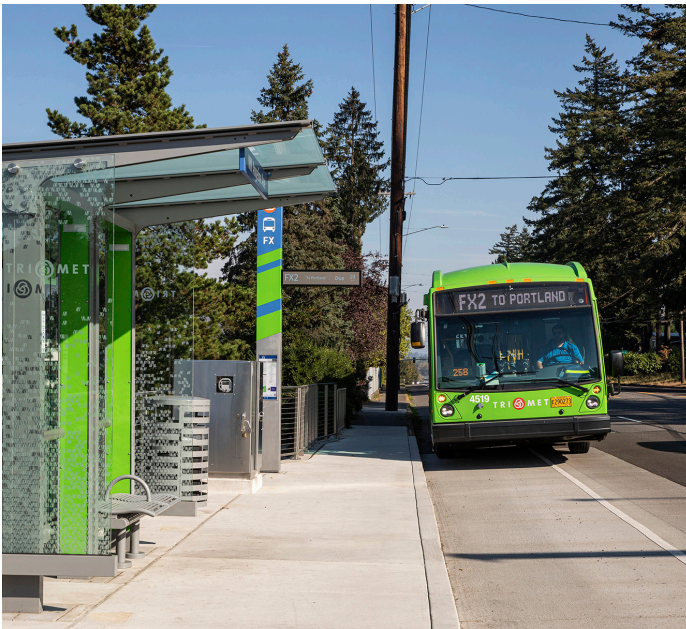
TriMet FX shelters improve safety with lighting, weather protection, clear sightlines and accessible platforms.