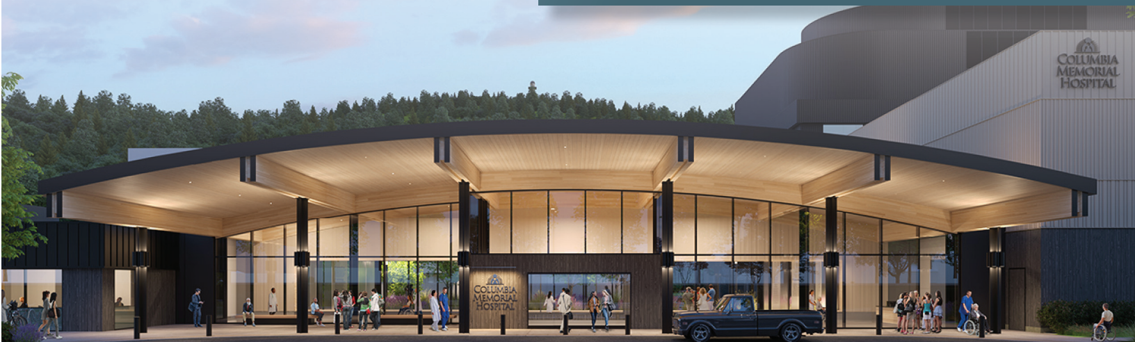
Proposed rendering of Columbia Memorial Hospital expansion.

CMH's main campus is located in Astoria, Oregon. We also operate outpatient medical and urgent care clinics in Warrenton and Seaside. CMH continues to grow and remains dedicated to serving and improving the health of our neighbors.