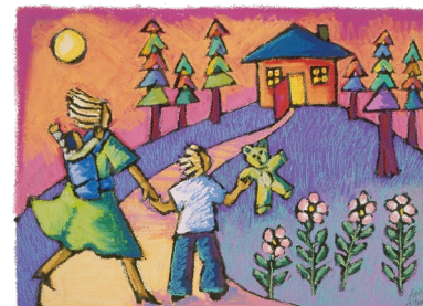
Formerly Mid-Valley Women's Crisis Service

We are requesting $700,000 in lottery bonds to complete critical repairs to our main advocacy office building. The building, built in 1967, is in dire need of a roof replacement, drywall repair, electrical and HVAC upgrades, seismic retrofitting and parking lot replacement. This project is ready, and the environmental review is complete. This project is needed to keep the property accessible and safe for years to come. We are requesting 51% of the project funds.