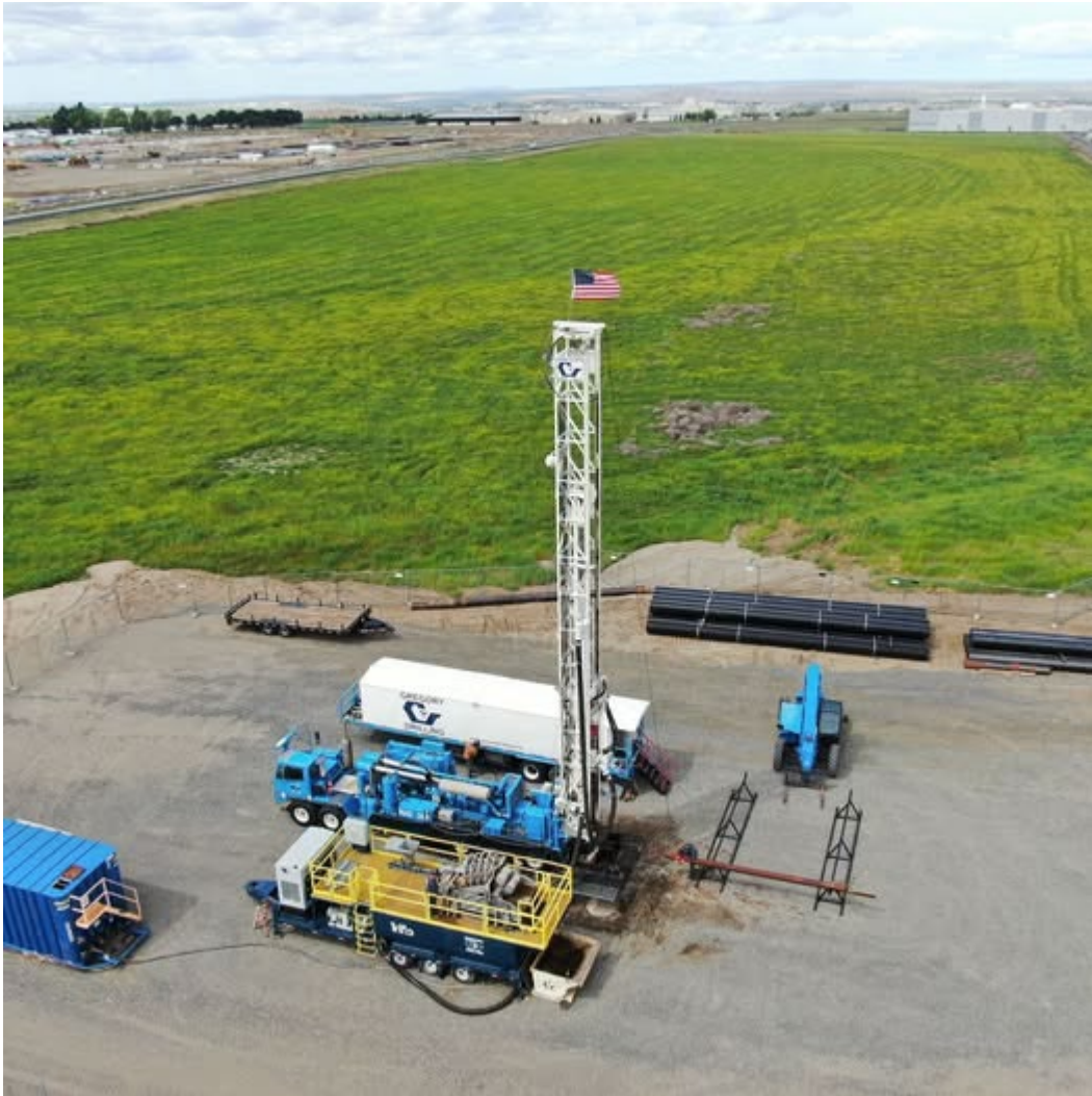
ASR Well Site Construction: April 29, 2025