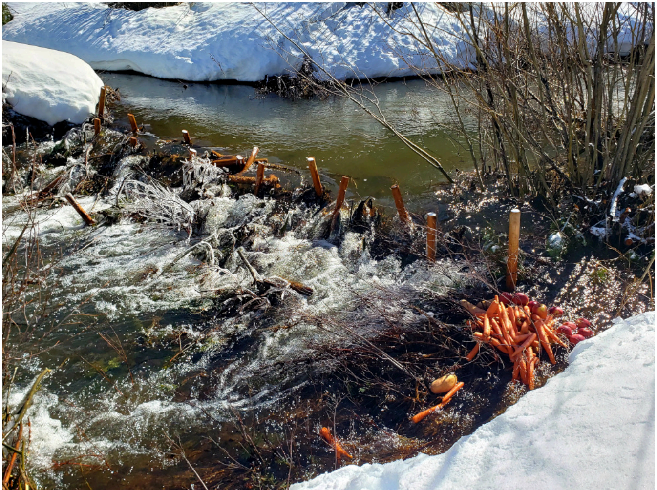
Water flows around a beaver structure.

Around the same time, Volpe and the monument ecologist began surveying the monument for places to plant beavers. In 2022 Shockey's crew began building “beaver dam analogs” at Vesper Meadow and strategic locations in the monument. These structures — BDAs, in restoration parlance — emulate the dams and lodges that beavers build. They act like speed bumps, slowing and spreading water behind them.