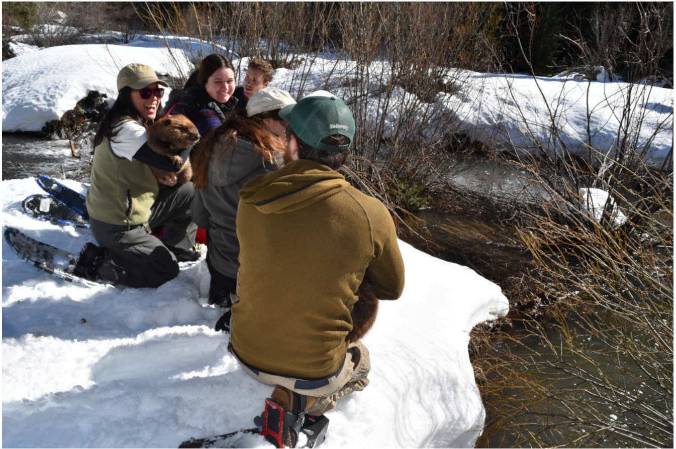
A volunteer holds one of the young beavers prior to release.

Moy says it would be “wondrous” if the beavers stick around; in any case, there’s still more work for humans to do.