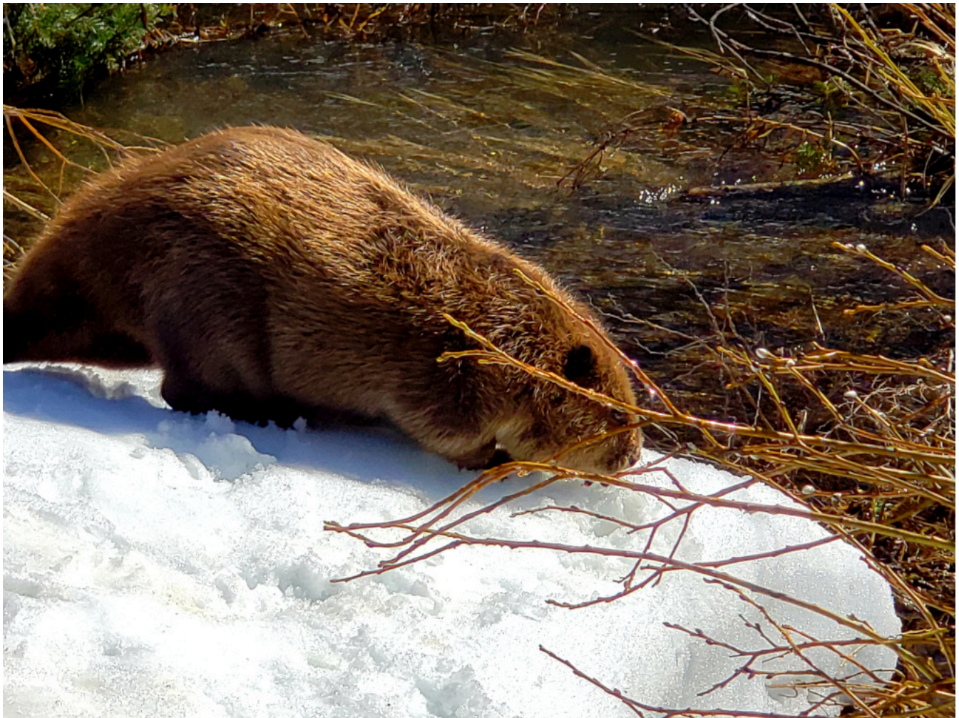
After release, one of the beavers stands in the snow before striking out into its new home.

The family we released was rescued from an irrigation ditch west of the monument. Left alone, these “nuisance beavers” faced an uncertain fate — perhaps even death.