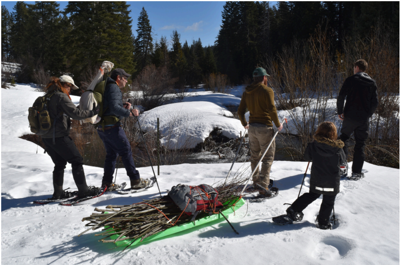
Volunteers transport the beavers on a sled and in sacks.

Volunteers helped each other strap the bags onto frame packs. The adult beavers weighed nearly 60 pounds, and the unwieldy packages bulged awkwardly, but the animals didn’t stir once strapped in place.