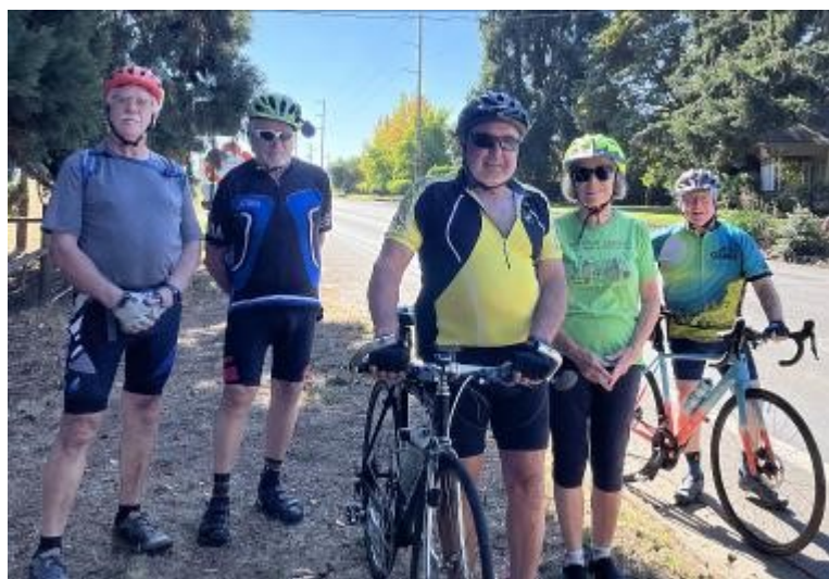
Great ride to Coburg with only 1 tire problem