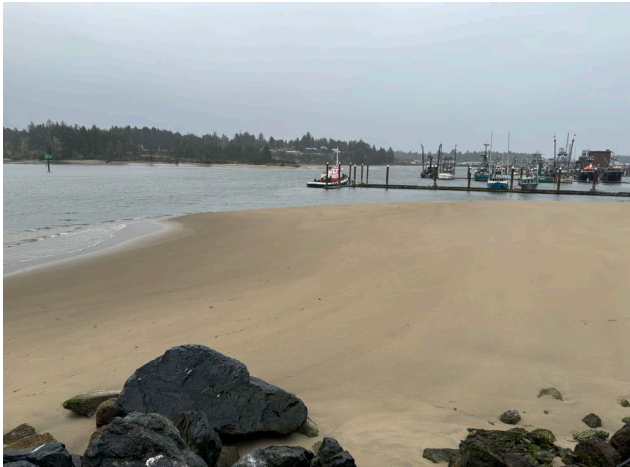
2024 view of the button shoal facing south at low tide