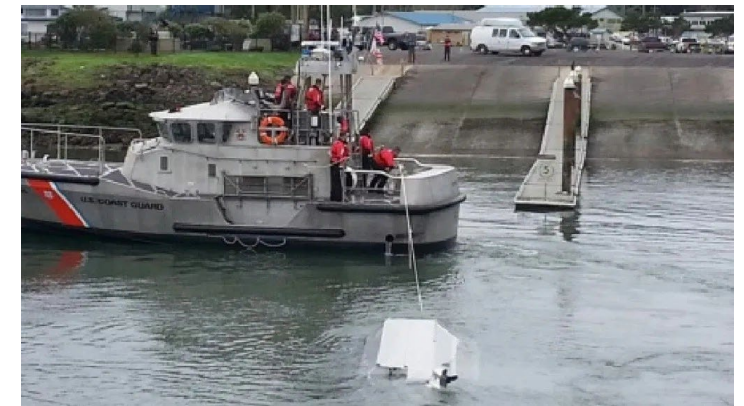
Capsize of a recreational vessel in 2016 requiring the rescue of three by USCG