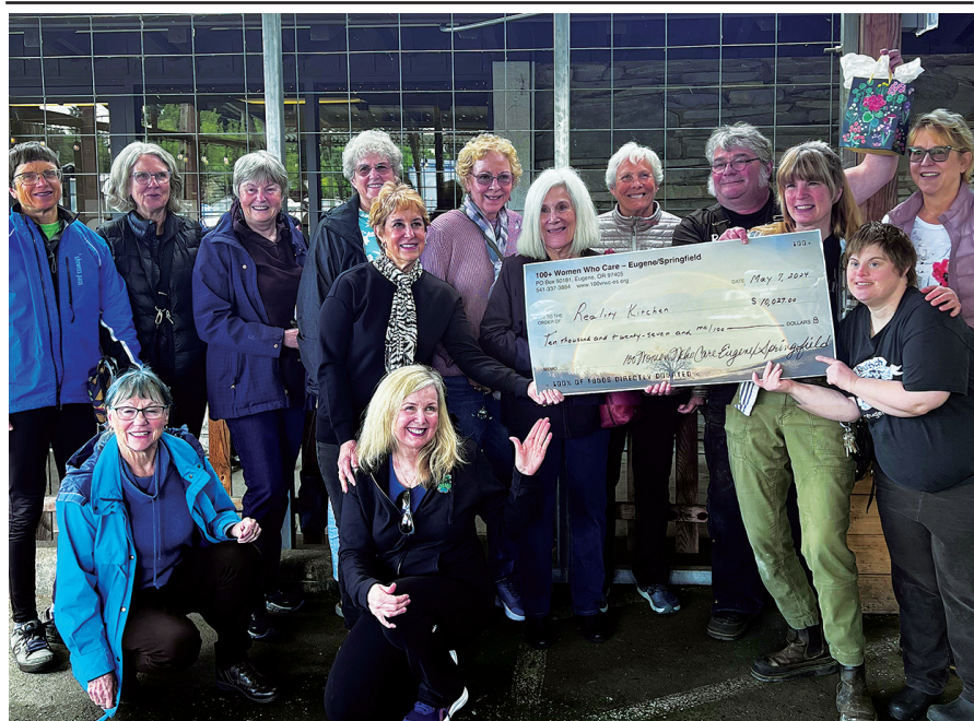
The Eugene 100 Women That Care put Reality Kitchen's recent fundraiser over the top to meet our goal, and we're asking your help again today to remain strong in 2025.

We ask you to become a Sustaining Member today and support us in building our capacity to grow.