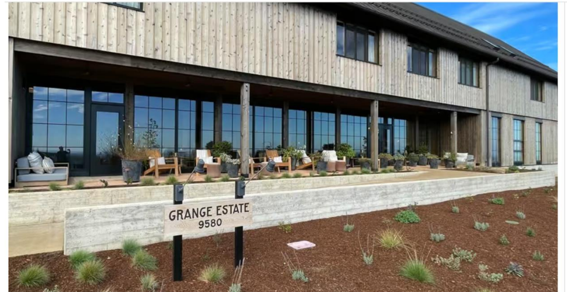
Grange Estate exterior.