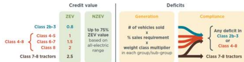
Figure 2: Diagram of credit values, deficit calculation, and regulatory compliance for a manufacturer in a given year.

The regulation is structured as a credit and deficit accounting system. A manufacturer accrues deficits based on the total volume of on-road HDT sales within California beginning with model year 2024 vehicles. These deficits must be offset with credits generated by the sale of zero-emission vehicles (ZEVs) 6 or near zero-emission vehicles (NZEVs) 7 starting in model year 2021. A schematic diagram of this accounting system is shown in Figure 2.