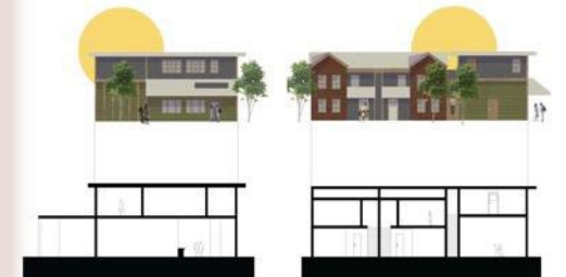
EAST/WEST FACADE AND SECTION