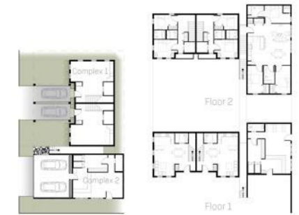
SITE PLAN 16'-1.0"