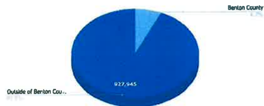
Coffin Butte Landfill: Where does the waste come from?

Sources: 2021 Oregon Material Recovery and Waste Generation Rates Report, Oregon DEQ; Coffin Butte Landfill Annual Report 2021