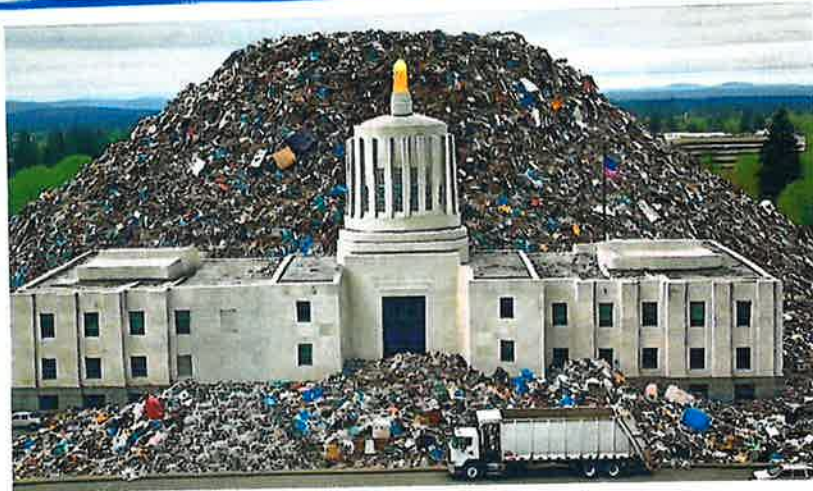
Oregon State Capitol

Coffin Butte accepts 1.1 million tons of waste a year. We asked AI to help us visualize what that looks like.