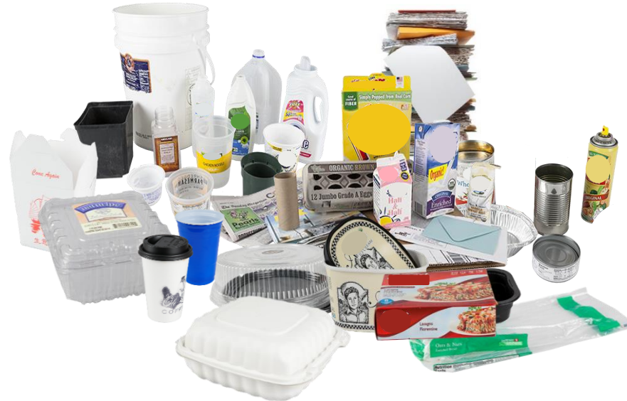
Printed paper, packaging and food serviceware Launching July 2025