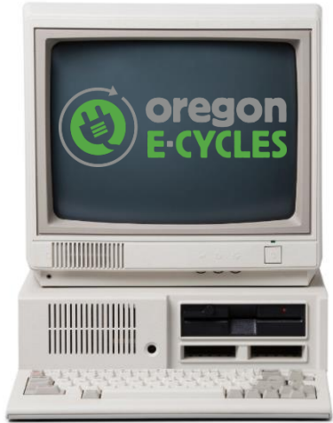
Electronics Recycling Program Launched in 2009