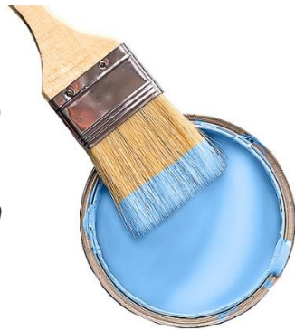
Paint Stewardship Program Launched in 2010