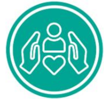
Birth – 5 Plan