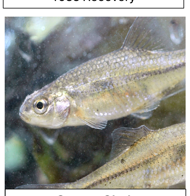
Oregon Chub 2014 ESA Recovery