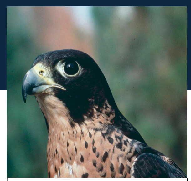
Peregrine Falcon 1999 ESA Recovery