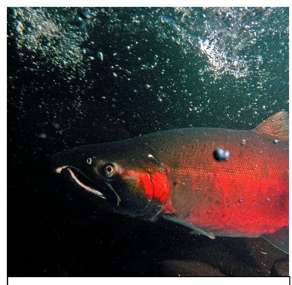
Oregon Coast Coho Salmon 202? ESA Recovery