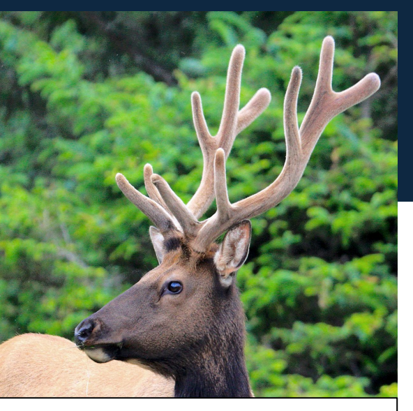
Roosevelt Elk 1938 Recovery