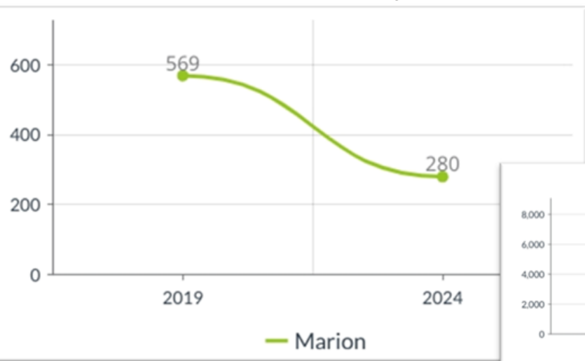
Children Currently in Foster Care Marion County