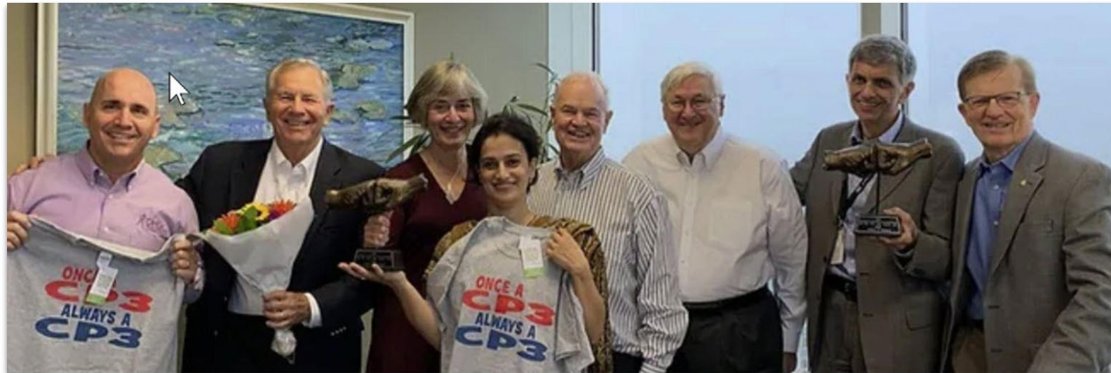
2019 CP3 Original Founders Photo

The safety and wellbeing of all children and families requires collective ownership by all Oregonians