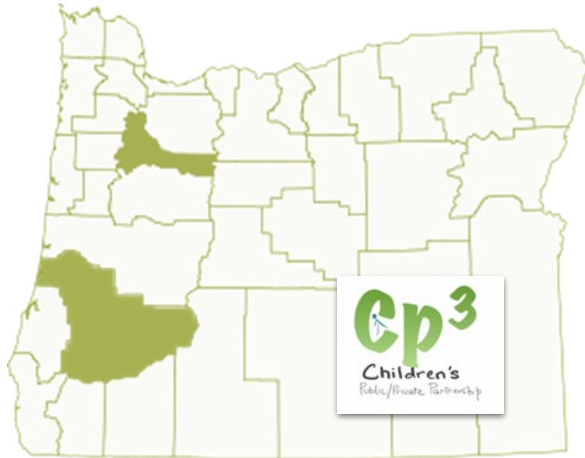
CP3 in Marion (2019) & Douglas (2021)