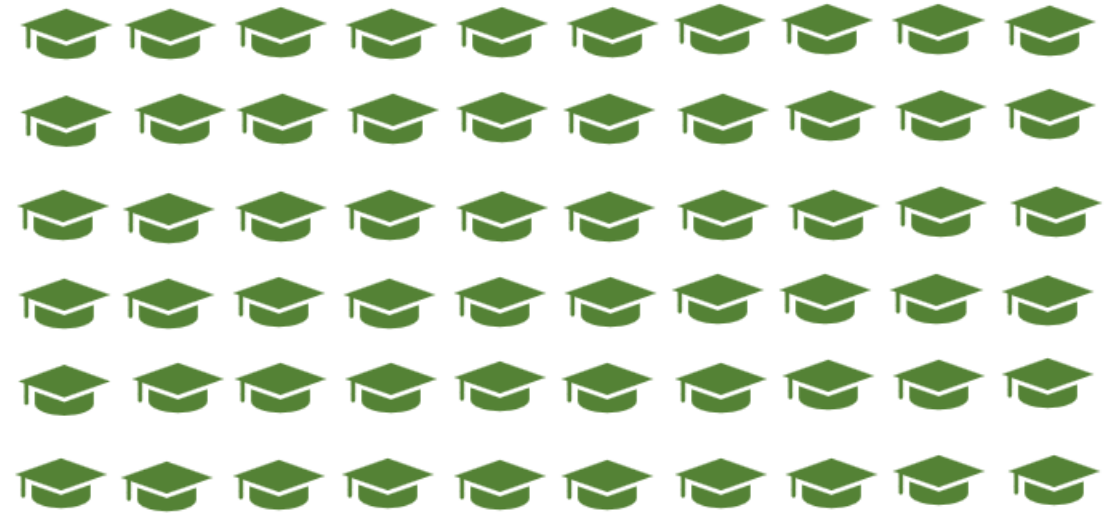
Promised Number of Students Trained for 1 year v. Projected Number of Students Trained for 1 year

Projected to exceed expectations by 100 cases.