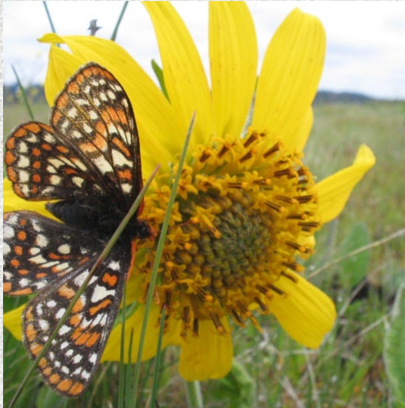
Taylor's Checkerspot Butterfly on Balsamroot, Close

Presentation to Legislative Natural Resources Subcommittee Oregon Parks and Recreation Department and US Fish and Wildlife Service 1/28/2025