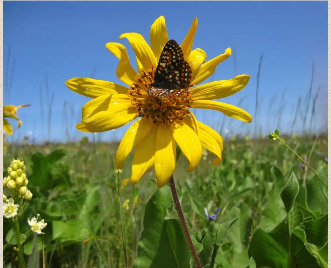
Taylor's Checkerspot Butterfly on Balsamroot