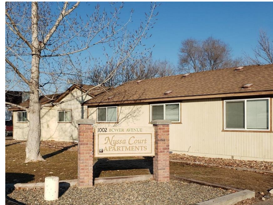
Nyssa Court, Nyssa, OR