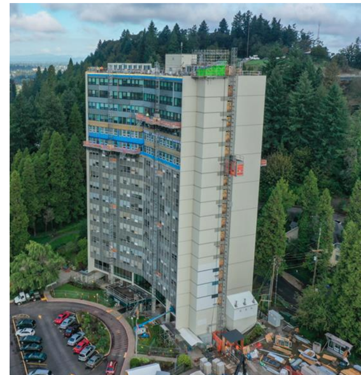
YaPoAh Terrace, Eugene, OR