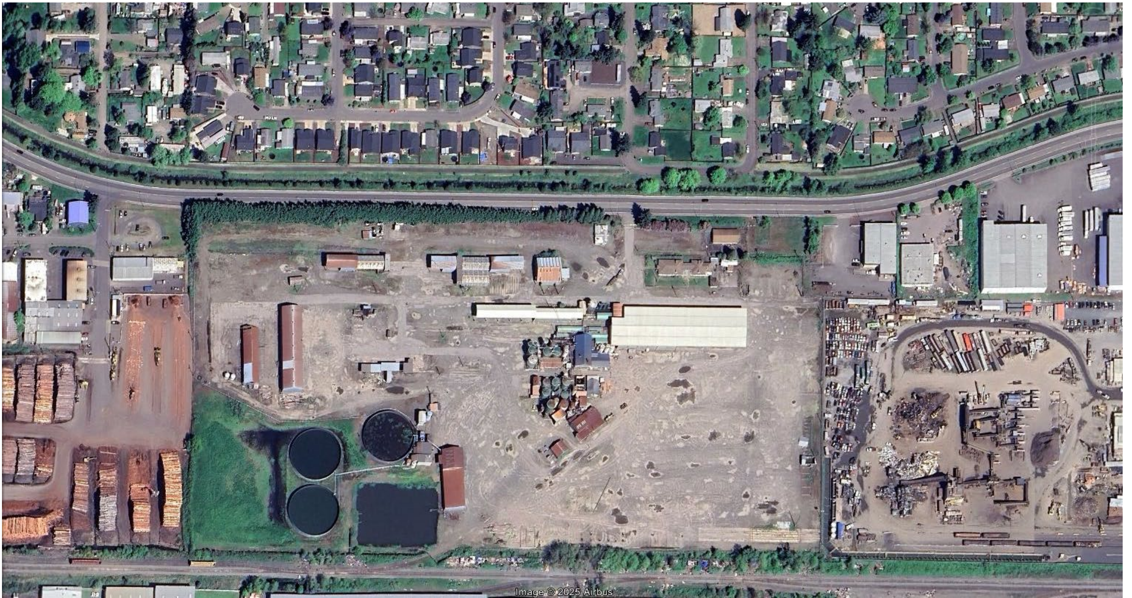
J.H. Baxter south of Roosevelt Boulevard in Eugene.