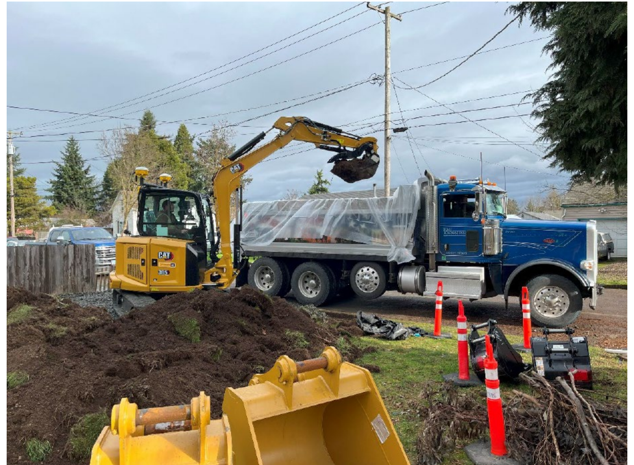
Excavator removing contaminated soil from a yard near J.H. Baxter in January 2024.