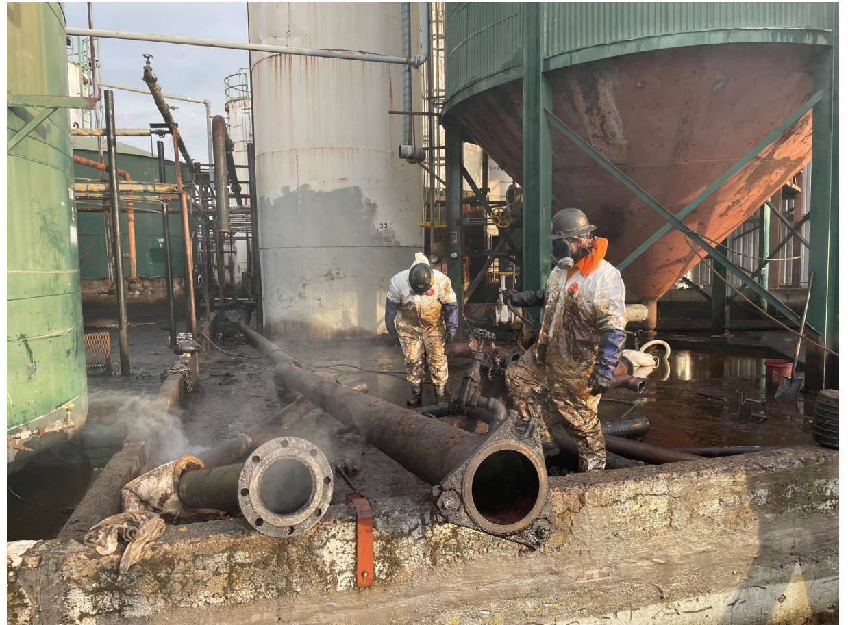
Ongoing cleanup at J.H. Baxter in November 2024.