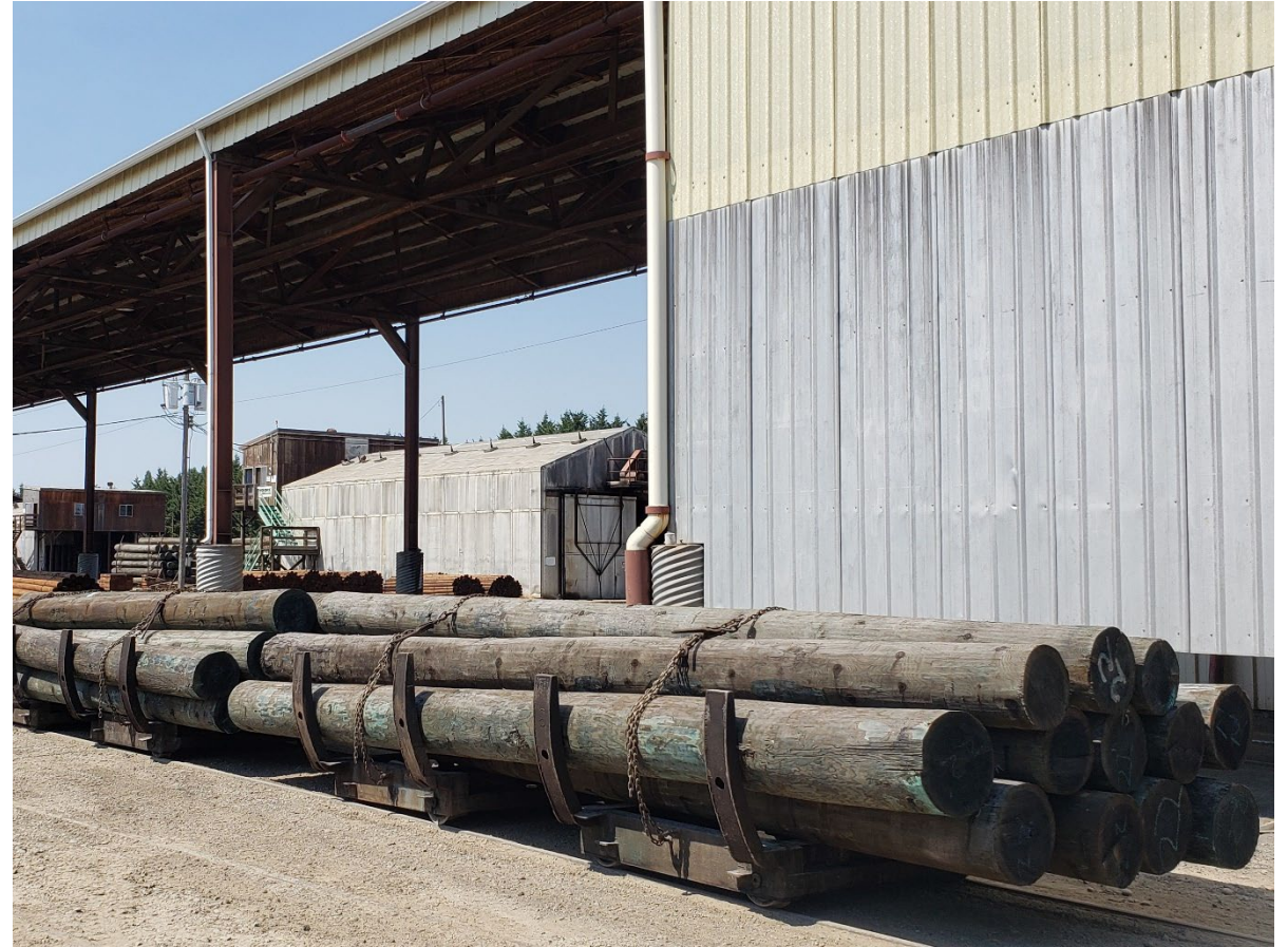
Treated utility poles at J.H. Baxter in 2021.