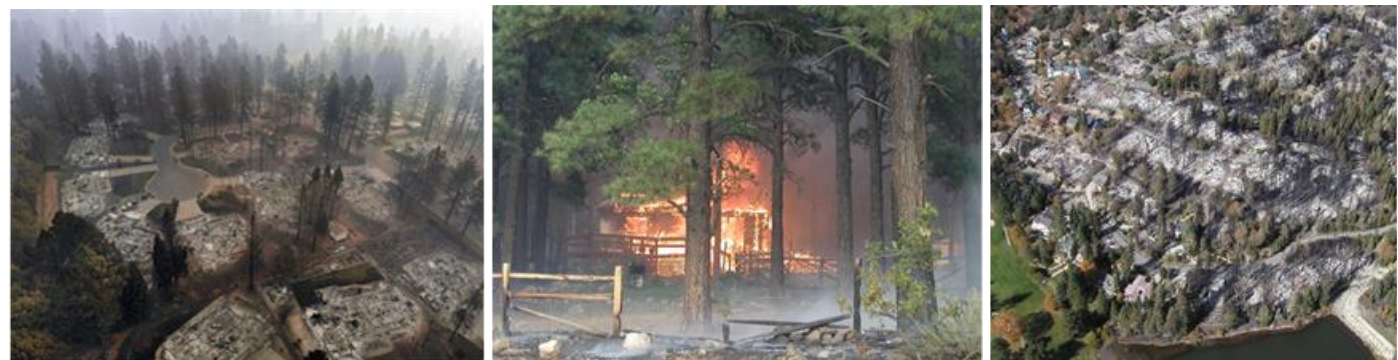
Paradise, CA; 2018 Camp Fire Southwest CO; 2002 Missionary Ridge Fire S Cal; 2007 Grass Valley Fire Figure 1.Destroyed homes interspersed with and adjacent to unburned, green, vegetation.

Wildfires occurring in continuous vegetation during severe weather (strong winds and low relative humidity) can produce extreme wildfire behavior in grass, shrub and forest fuels that overwhelms wildfire suppression and control. Extreme wildfire approaching a community can initiate multiple, simultaneous ignitions of structures, vegetation and other combustible materials within the community. Subsequently, the burning structures and vegetation continue the community fire spread and destruction for hours after wildfire influence has ceased (Cohen and Stratton 2008; Cohen 2010; Cohen and Westhaver 2022).