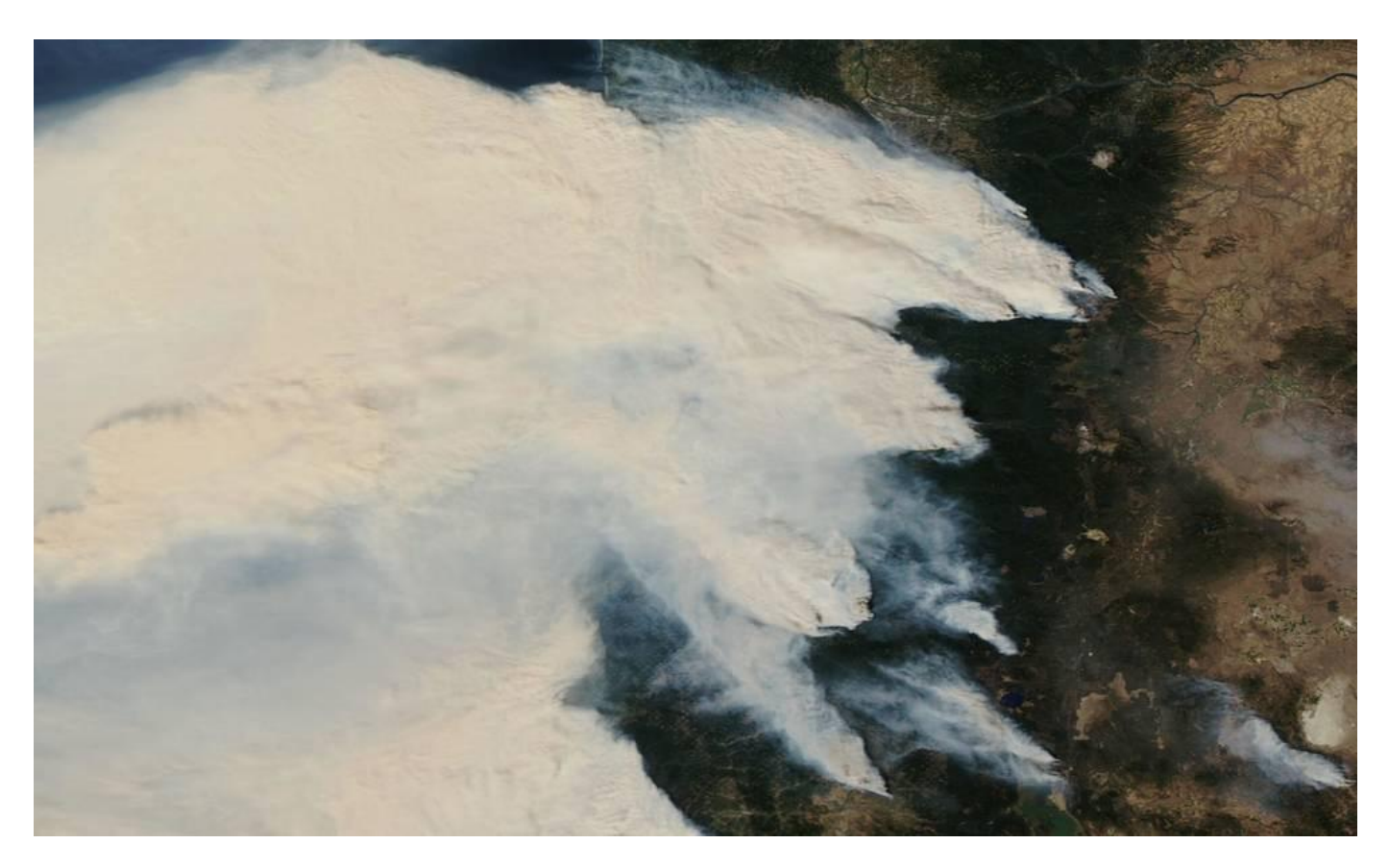
Powerline Ignited Fires in Oregon - Compiled as of Feb 12, 2024

Williams Creek - 2015 (Public lands) Ramsey Canyon - 2018 (Jackson County) North Bank Lane - 2020 (Coos County) Pike Road - 2020 (Tillamook County)