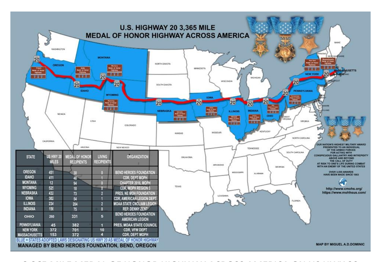
3,365 MILE MEDAL OF HONOR HIGHWAY ACROSS AMERICA ON US HWY 20 BETWEEN PACIFIC AND ATLANTIC OCEANS