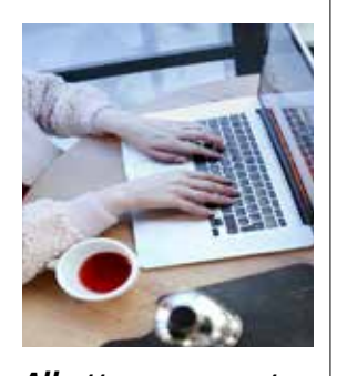
All attorneys must file pleadings with DRO electronically.

DRO advocates for the voices of protected people being heard and considered in decision making, because this is key for independence, self-reliance, and dignity. Further, guardians are required to listen to and to act on their protected person's personal values and wishes, unless harmful. ORS 125.315(g), (h) and (i).