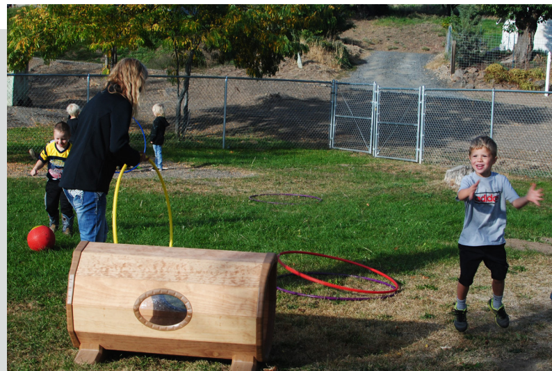
Children learn, play, and spend nearly 100% of their time outside at Tygh Valley Head Start, Mid-Columbia Children's Council.

In 2017, Washington passed SB 5357 . The bill successfully established a four-year pilot project during which outdoor preschools operated for full days while working with state agencies and lawmakers to establish a path to licensure for outdoor preschools. In 2021, Washington became the first in the nation to permanently license outdoor, nature-based child care for preschool and school-age children under SB 5151 . These bills addressed the same regulatory challenges that Oregon outdoor preschools face, and so we propose that Oregon pass an analogous bill or explore other policy pathways to licensure in 2023.