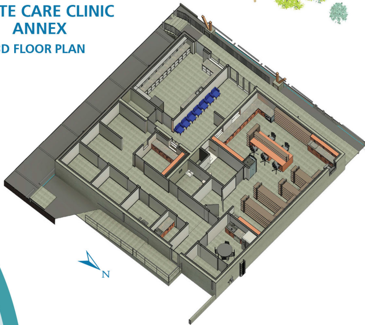
ACUTE CARE CLINIC ANNEX 3D FLOOR PLAN