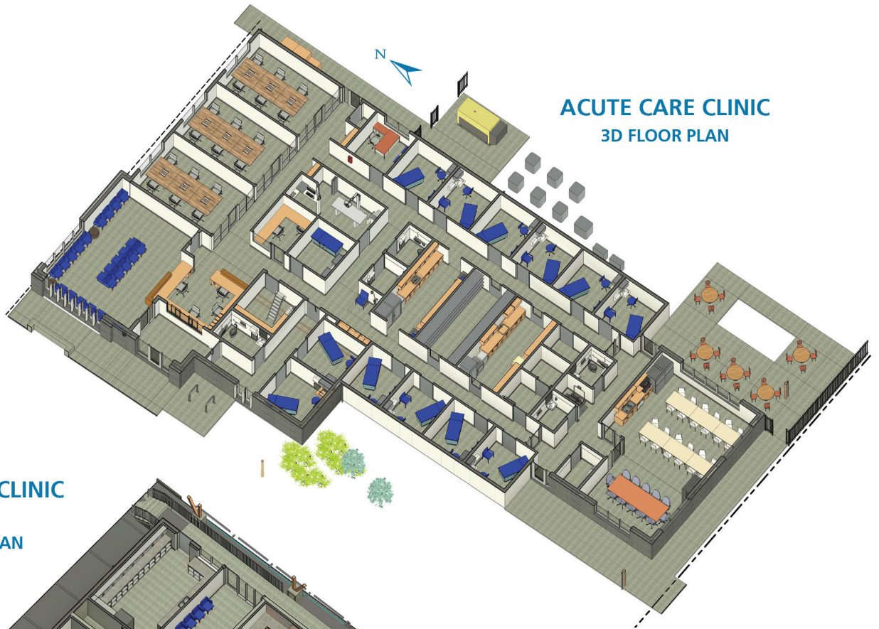
ACUTE CARE CLINIC 3D FLOOR PLAN