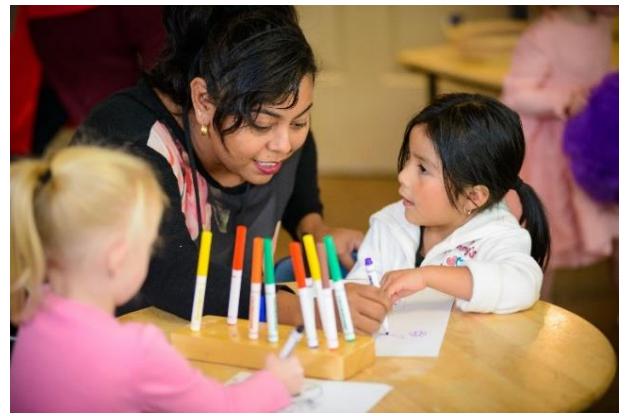
Up to 30 educators per year will be trained through the COCC Early Childhood Education program and up to 100 childcare slots will be available to the community.

Community Need for Project: Central Oregon is a well-documented childcare desert, with only one open childcare slot for every three children in our region. Staffing shortages in childcare and healthcare are also well documented and are heavily affecting Central Oregon. Demand for COCC health careers students from local employers cannot keep up with the number of graduates. COCC has met with business and community leaders in Madras over the last 18 months, and all have identified the lack of childcare and the lack of healthcare and childcare staff among the largest needs in the community. To address these issues, COCC has engaged with community childcare and healthcare partners over the last several years to identify solutions.