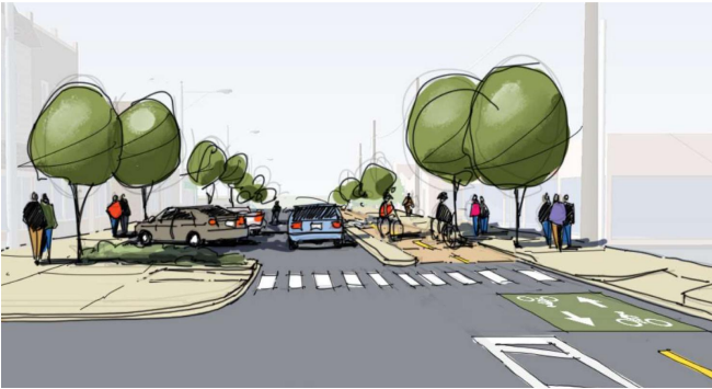
Oct 2022 Hood River Urban Renewal Agency voted on a new design with a protected bikeway on 12th Street and safer crossings over 12th and 13th because of the support for child friendly streets.

would require a jurisdictional transfer and more than $30 million, which the city cannot afford. We need help from the original owner of the roads, ODOT.