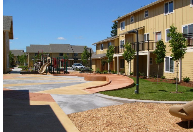
Colonia Libertad, Salem 1, 2,3. and 4 bedrooms