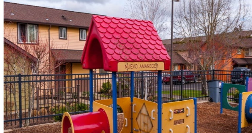
Nuevo Amanecer II, Woodburn 2.3 and 4 bedrooms