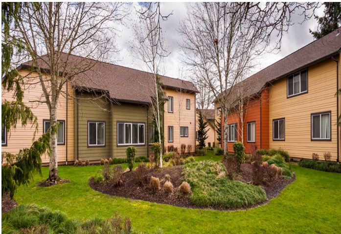
Nuevo Amanecer I, Woodburn 2.3 and 4 bedrooms