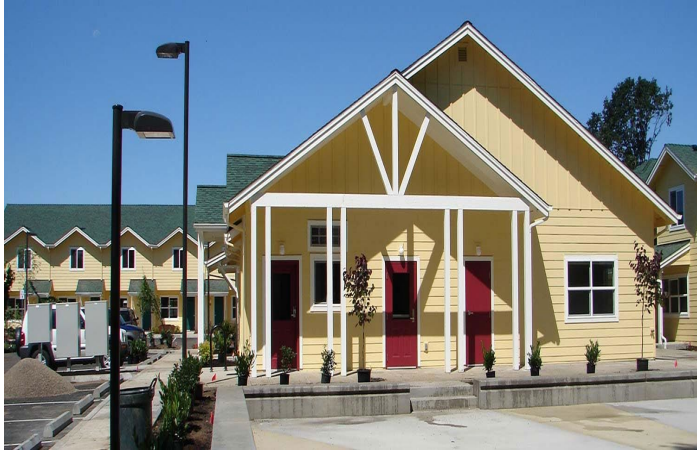
Colonia Amistad, Independence 2.3.4 bedrooms