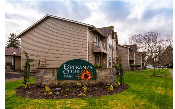
Esperanza Court, Woodburn 2 bedrooms