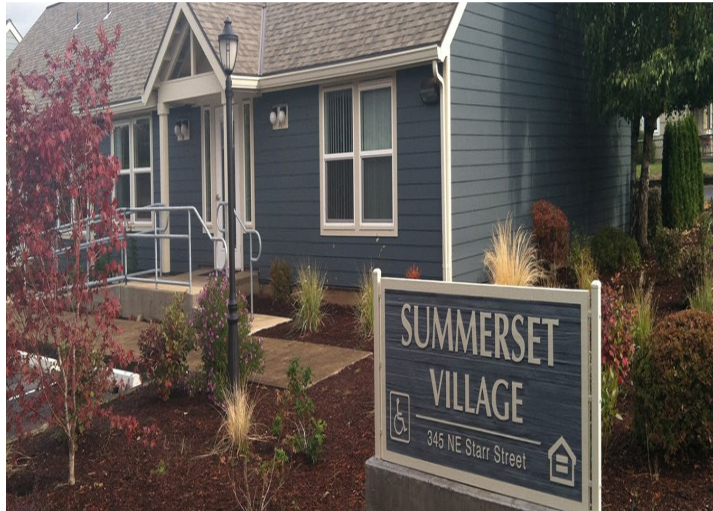
Summerset Senior Sublimity 1- and 2-bedroom units