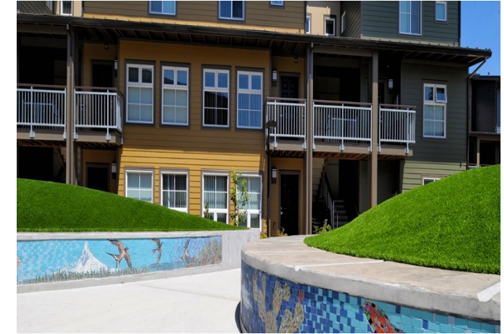
Nuevo Amanecer IV, Woodburn 2.3 and 4 bedrooms