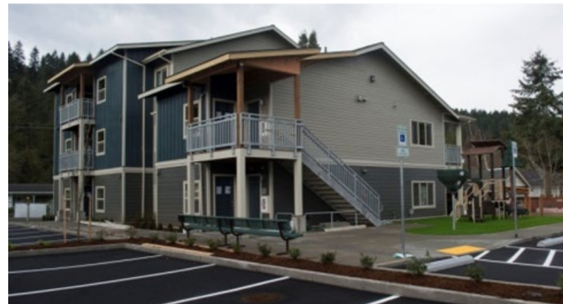
Colonia Jardines Silverton, OR 2- and 3-bedroom units