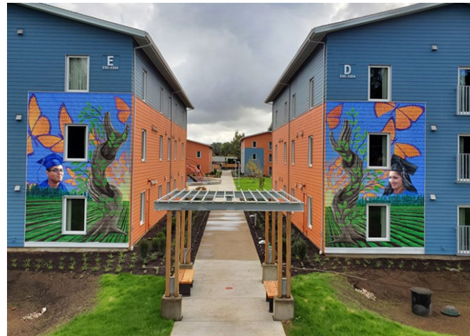
Colonia Unidad, Independence 2.3. bedrooms / Workforce & Farmworker