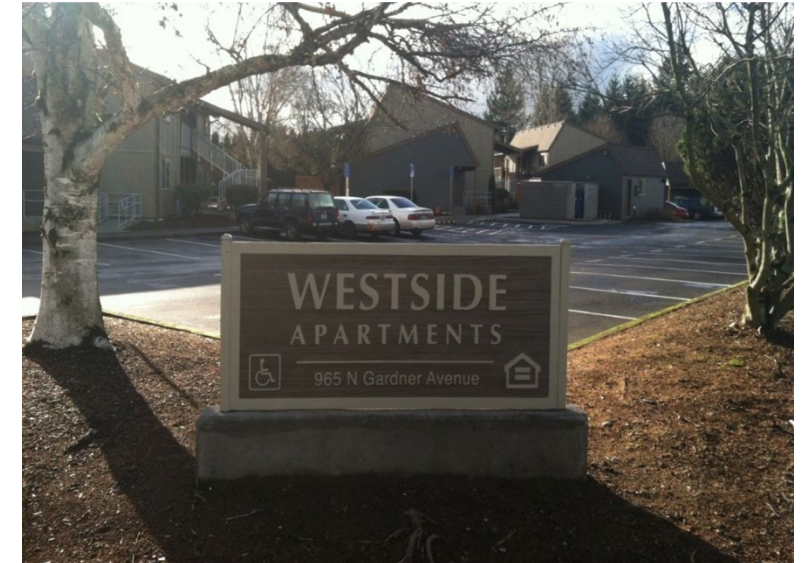
Westside – Low Income Family 1- and 2-bedroom units