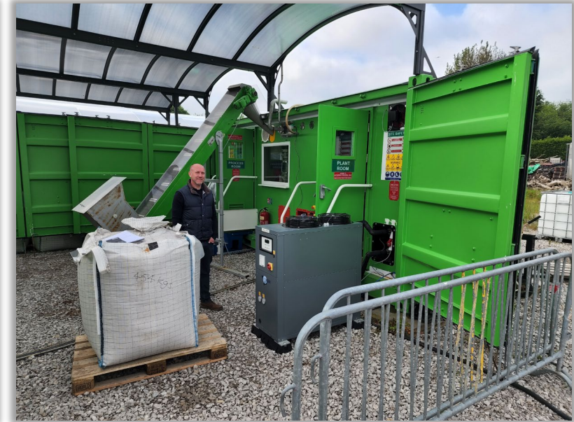
Com-Kiln Wood Residual Processor