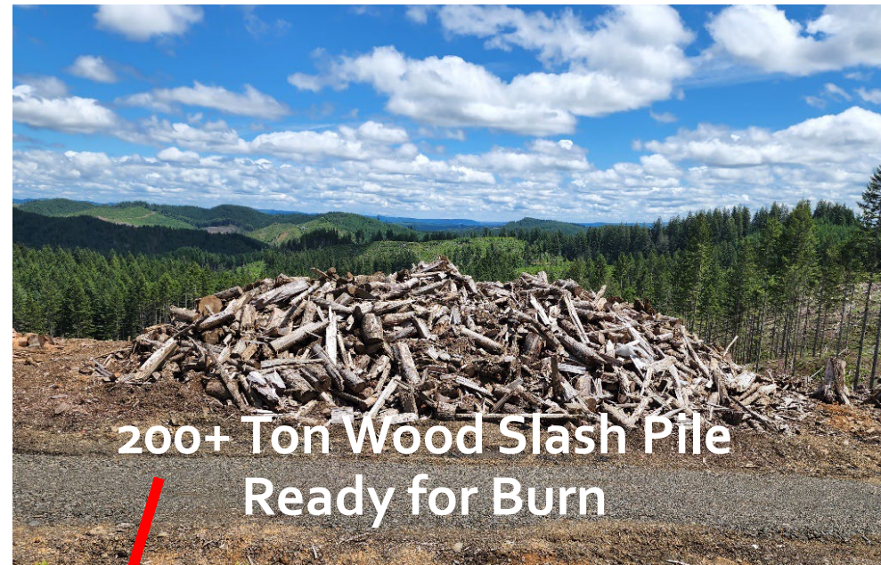
200+ Ton Wood Slash Pile Ready for Burn