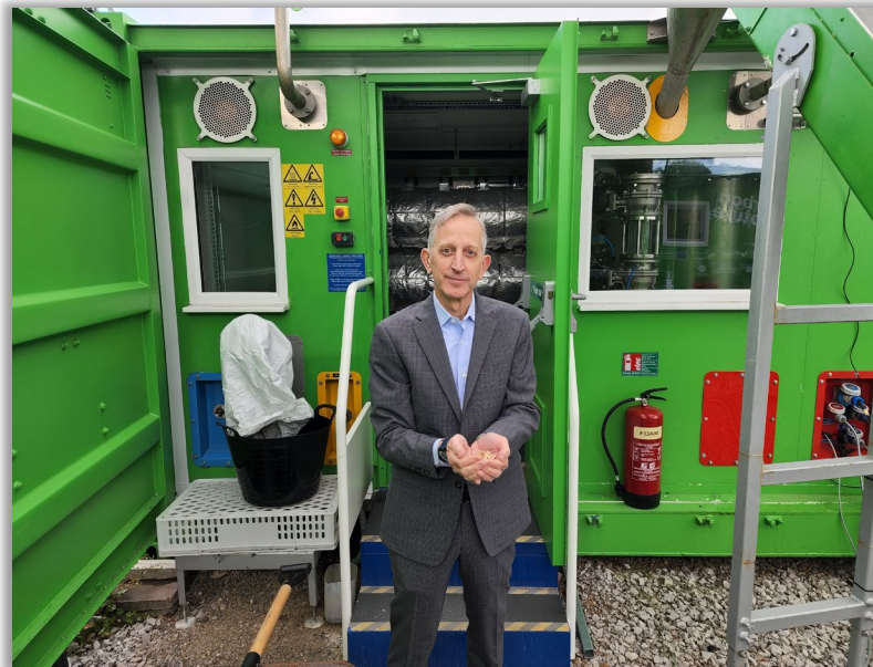
Wood Chips Ready for Processing