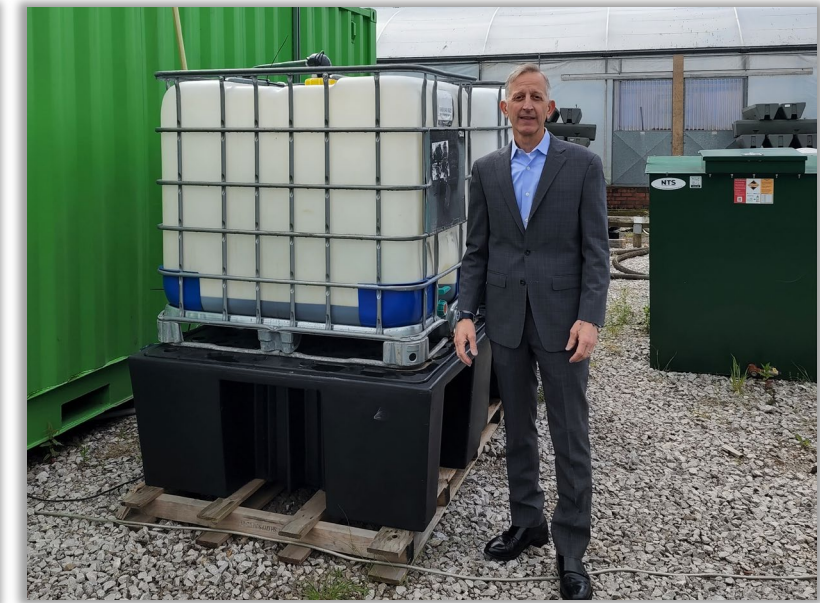
Post-Production Green Biocrude