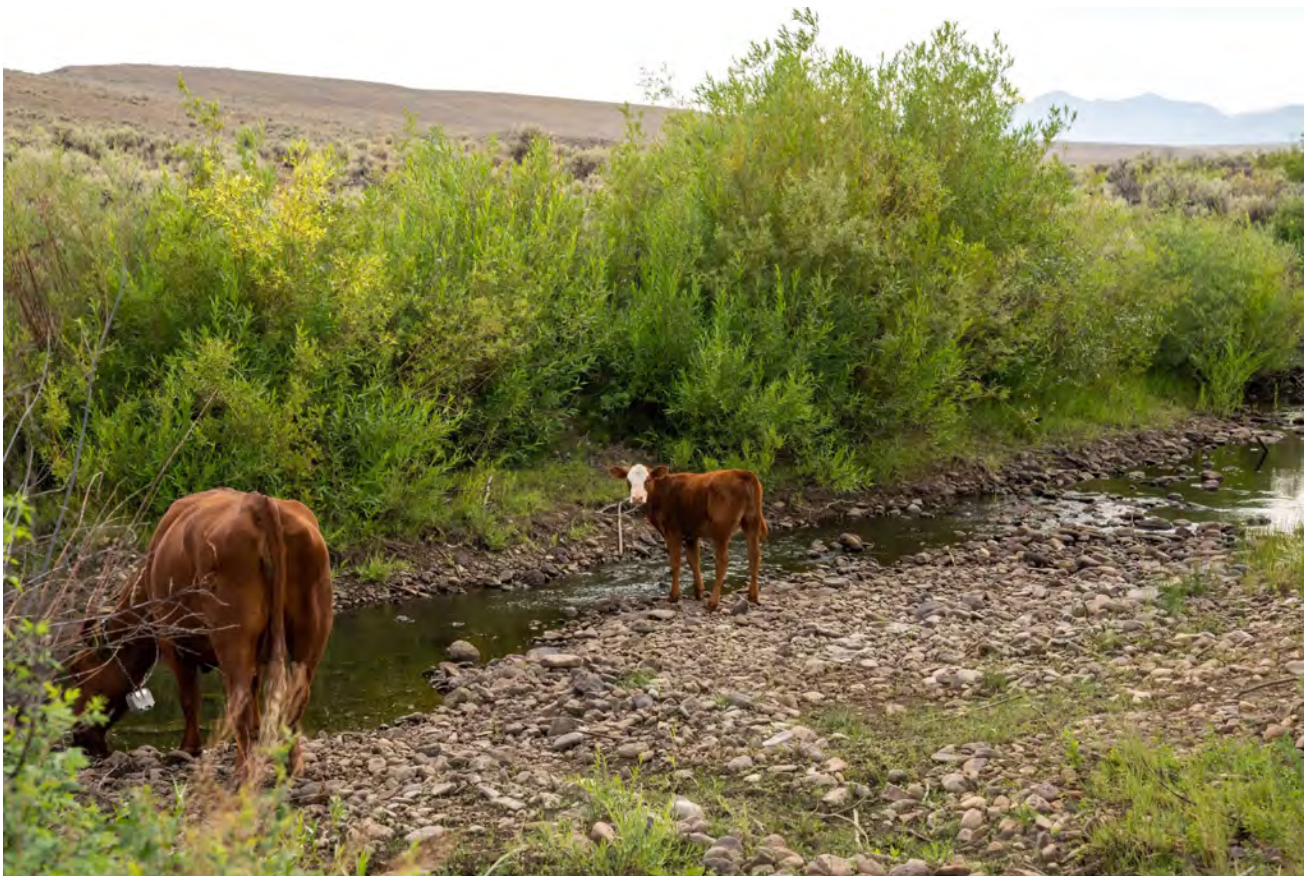
Beaver pools kept livestock with enough water during last year's drought.