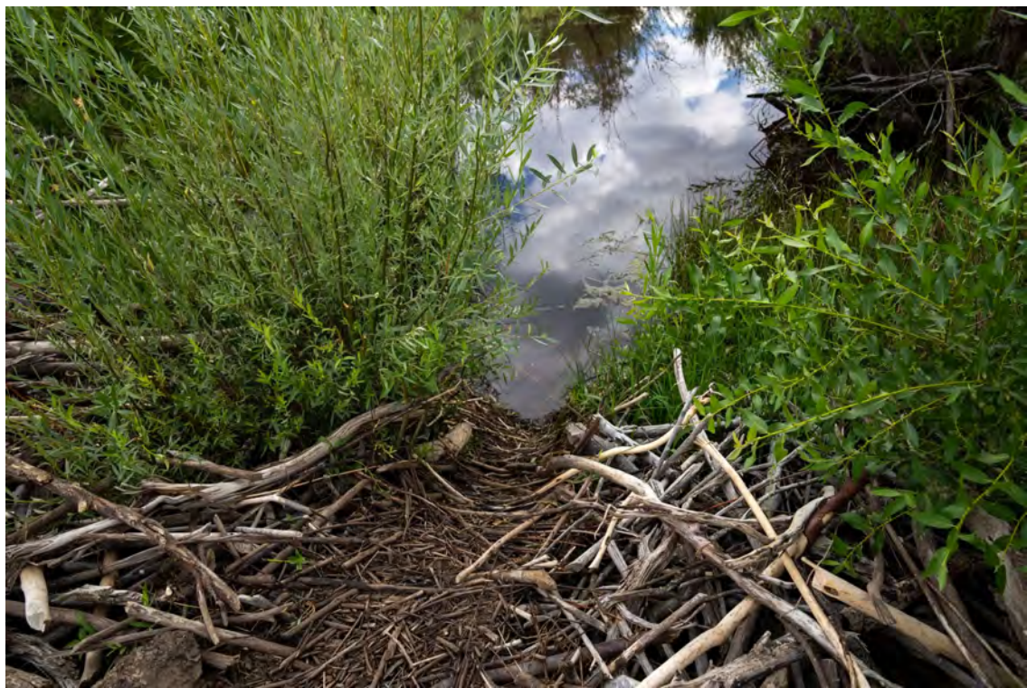
A beaver path on a dam at Cottonwood Ranch.