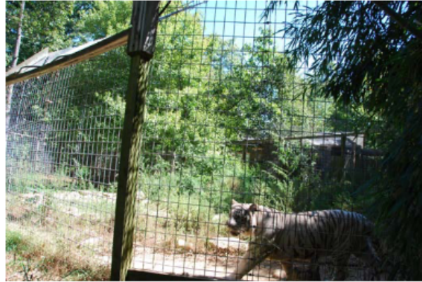
Tigers can jump at least 16-feet vertically, yet this tiger was housed in an enclosure with an estimated 10-foot high fence.