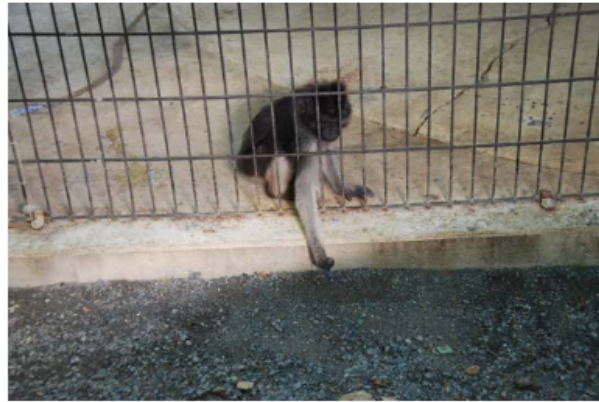
There was no evidence of a comprehensive enrichment strategy to promote the psychological well-being of the many primates at Catoctin Zoo, including this young macaque who tried to entertain himself by grabbing a handful of gravel.