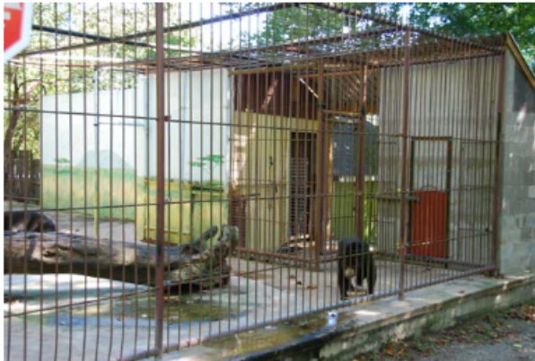
The shockingly inhumane and outdated sun bear cage meets ZAA's inadequate standards. In contrast, the AZA-accredited Oakland Zoo provides its sun bears with 1-acre of natural habitat that allows the bears to climb, dig, bath in a pool, and forage.