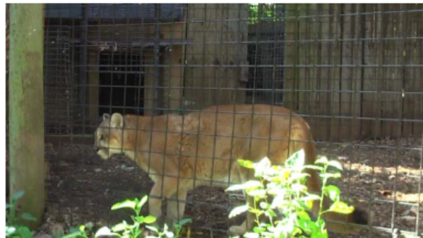
This cougar at Catoctin Zoo was euthanized after being attacked by a wolf in an adjacent cage.