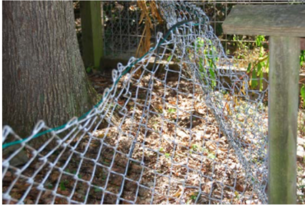
A bent, sagging fence next to a tiger cage could easily allow a child to penetrate the public safety barrier.

In September 2013, The HSUS arranged for two captive wildlife experts with more than 80 years of combined experience to visit and evaluate the Catoctin Zoo. The experts observed injured animals, inappropriate mixed-species exhibits, undersized and outdated cages, poorly designed, unhealthy, and potentially unsafe exhibits, filthy cages, drinking water, and food bowls, a lack of enrichment for many species, and enclosures in disrepair. Following are just a few of many problems found at Catoctin Zoo: