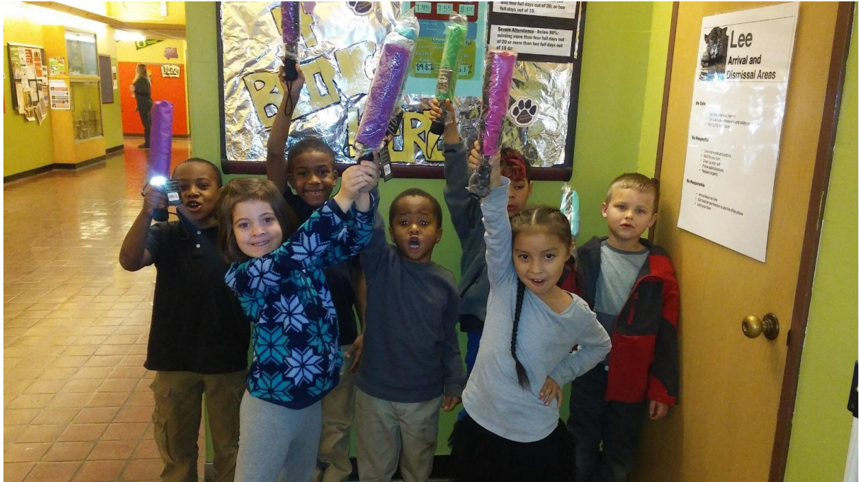
Umbrellas donated from PBOT