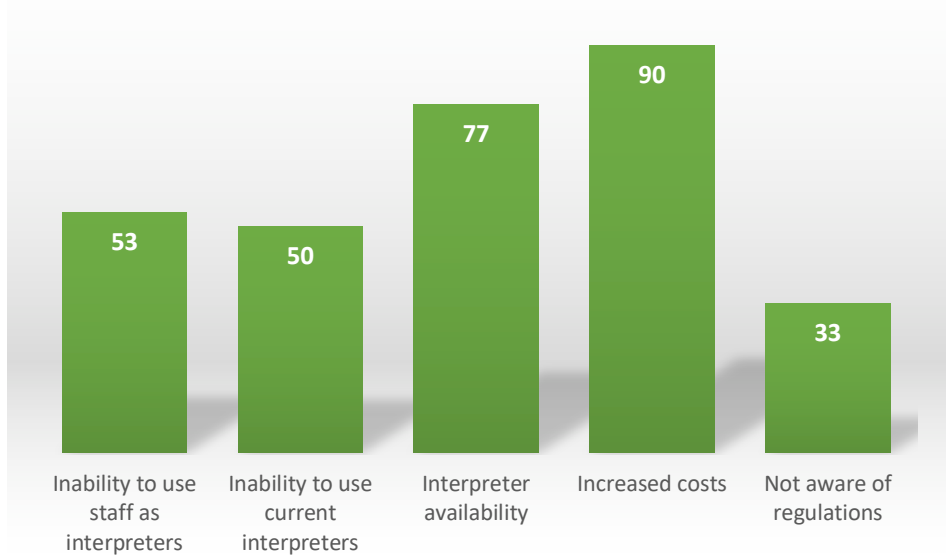
Health Care Interpreter Requirement Concerns