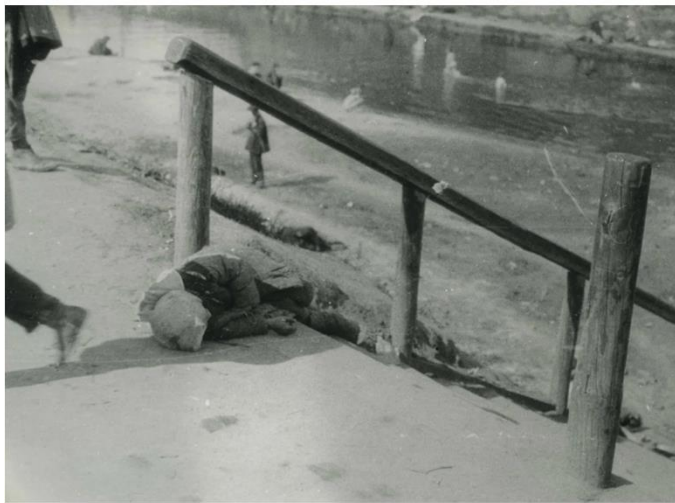
Dead child on the streets of Kharkiv, Ukraine, during the Holodomor, photo by Alexander Wienerberger, 1933.

“Russia today cannot be judged by Western standards or interpreted in Western terms.” “To put it brutally, you can't make an omelet without breaking eggs.”