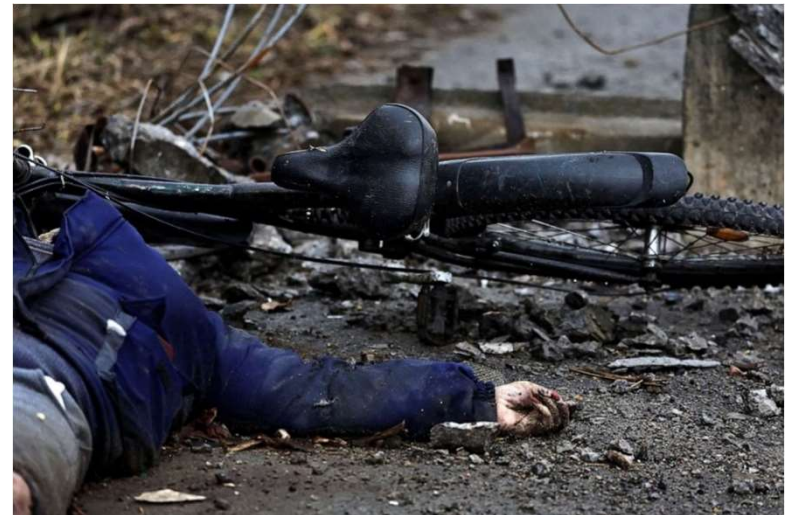
A body of a woman, who according to residents was killed by Russian army soldiers, lies on the street, amid Russia's invasion of Ukraine, in Bucha, Ukraine April 2, 2022.