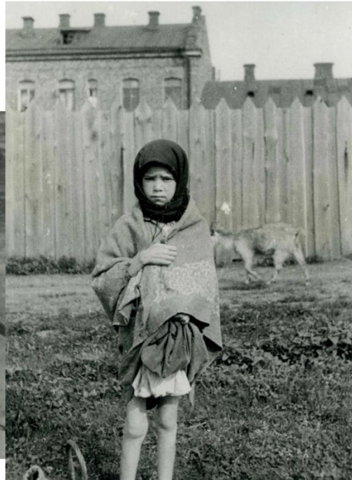
A young child, showing obvious signs of starvation, during the Holodomor, Kharkiv, Ukraine, Holodomor | Facts, Definition, & Death Toll | Britannica

Holodomor | Facts, Definition, & Death Toll | Britannica