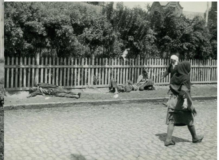
Victim of the Holodomor, Kharkiv, Ukraine

Holodomor | Facts, Definition, & Death Toll | Britannica