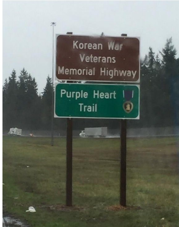
KOREAN WAR HIGHWAY AND PURPLE HEART TRAIL I-5