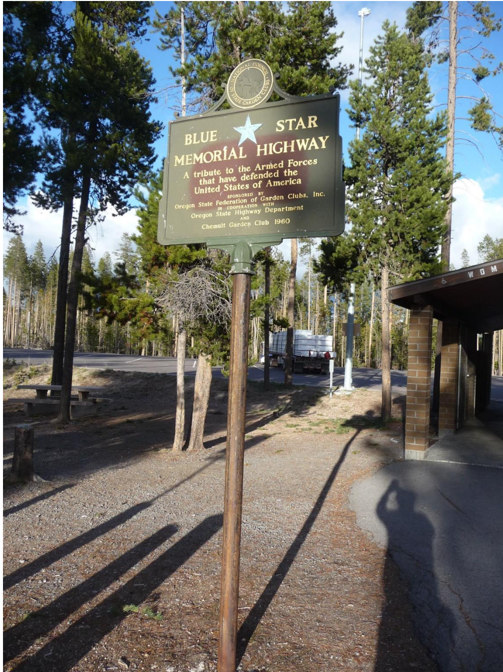
TYPICAL OF 86 BLUE STAR MEMORIAL HIGHWAY SIGNS INSTALLED ACROSS OREGON TYPICALLY IN REST STOPS