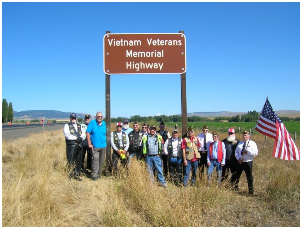
VIETNAM VETERANS MEMORIAL HIGHWAY I-84