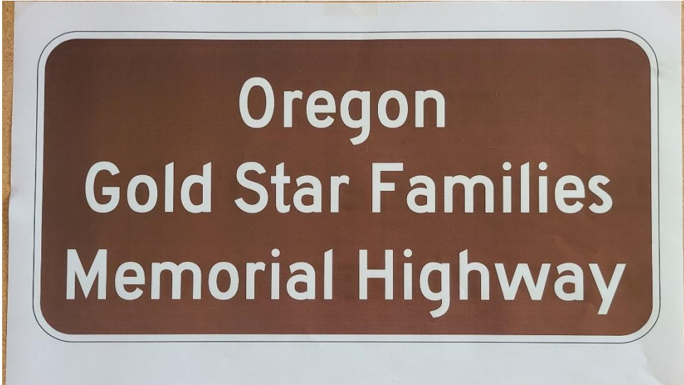
PROPOSED DESIGN FOR 4 FT X 8 FT SIGNS ON US HWY 30 ACROSS OREGON