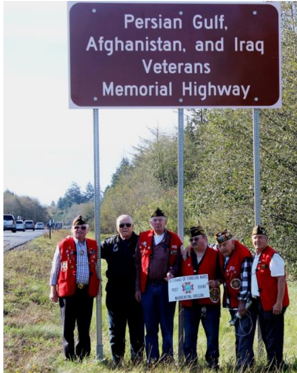
PERSIAN GULF, AFGHANISTAN, IRAQ VETERANS MEMORIAL HIGHWAY U.S. HWY 101