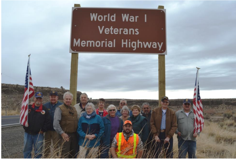
WWI VETERANS MEMORIAL HIGHWAY U.S. HWY 395