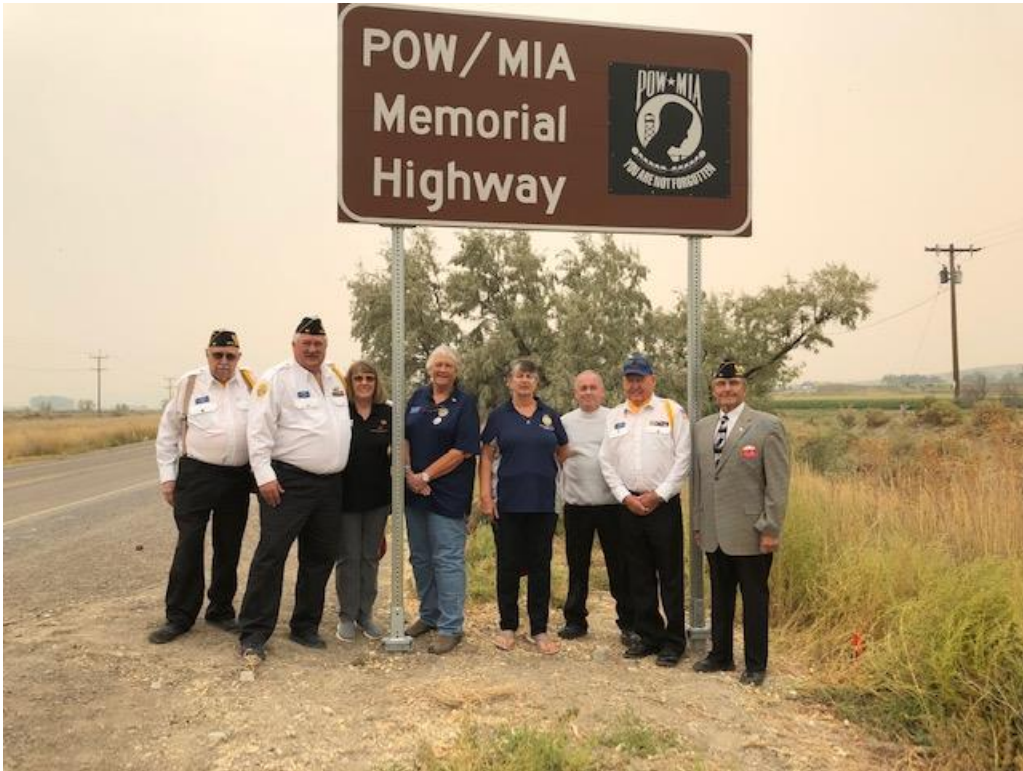
POW/MIA MEMORIAL HIGHWAY U.S. HWY 26