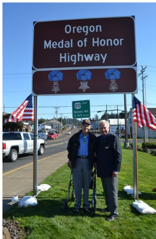
OREGON MEDAL OF HONOR HIGHWAY U.S. HWY 20