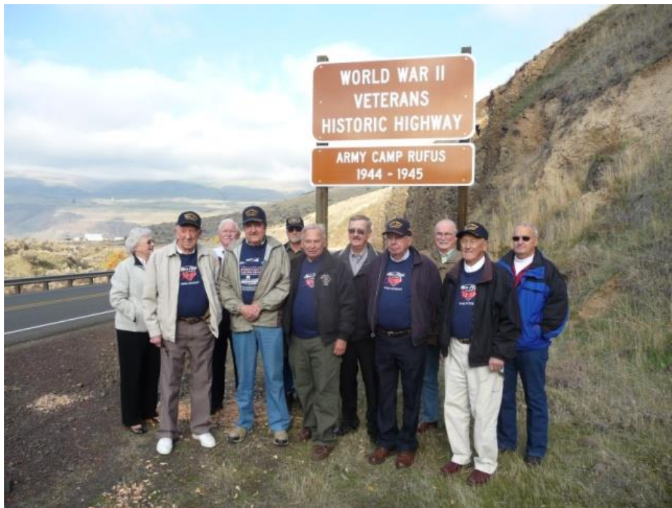
WWII VETERANS HISTORIC HIGHWAY U.S. HWY 97, PORTION S.R. 126