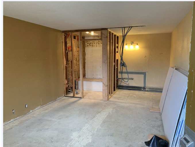
Under Construction (Conversion)