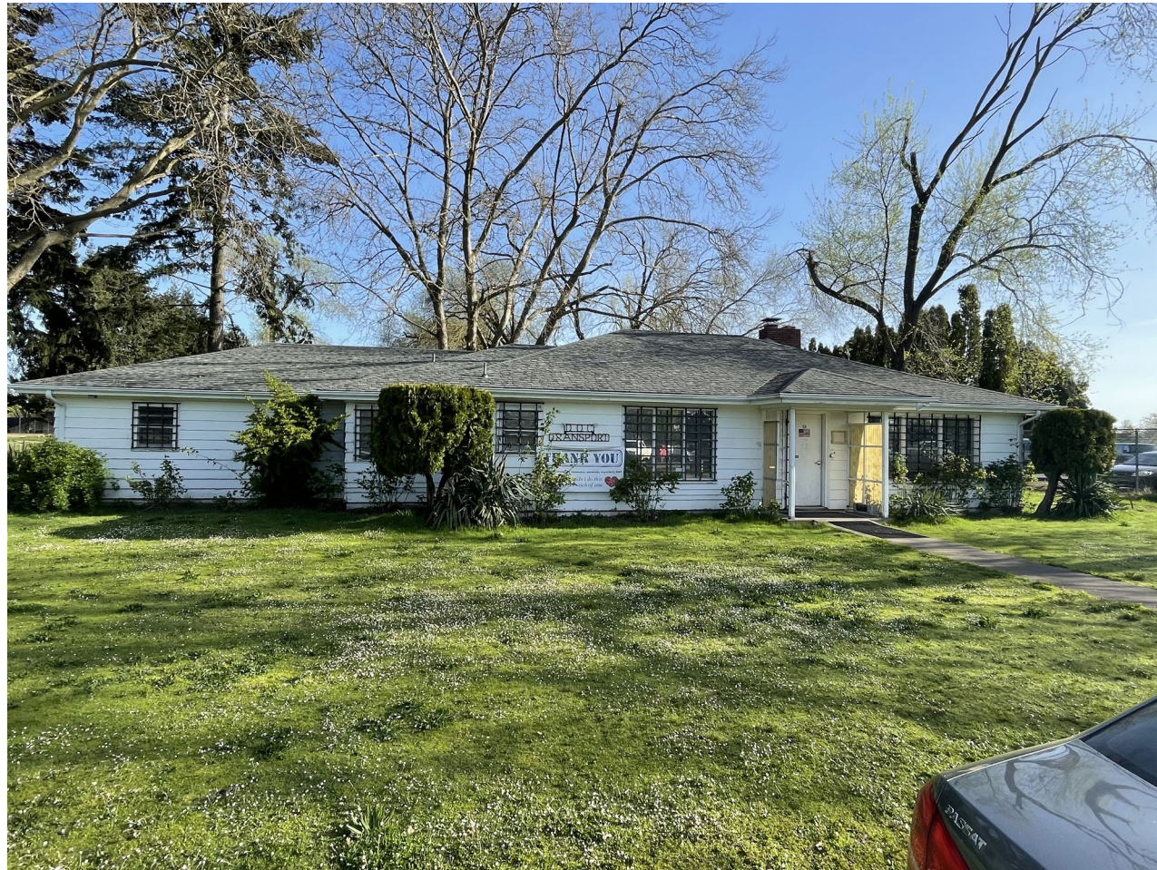
Current Transport HQ