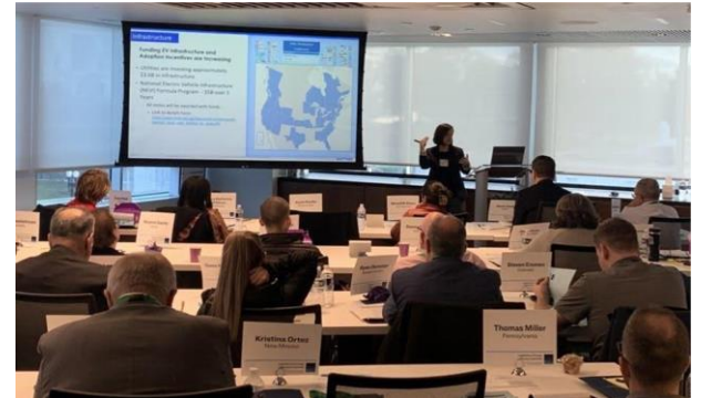
LEHI Classroom Session in D.C.