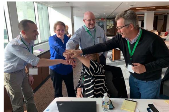
Interactive utility capacity planning simulation by NARUC