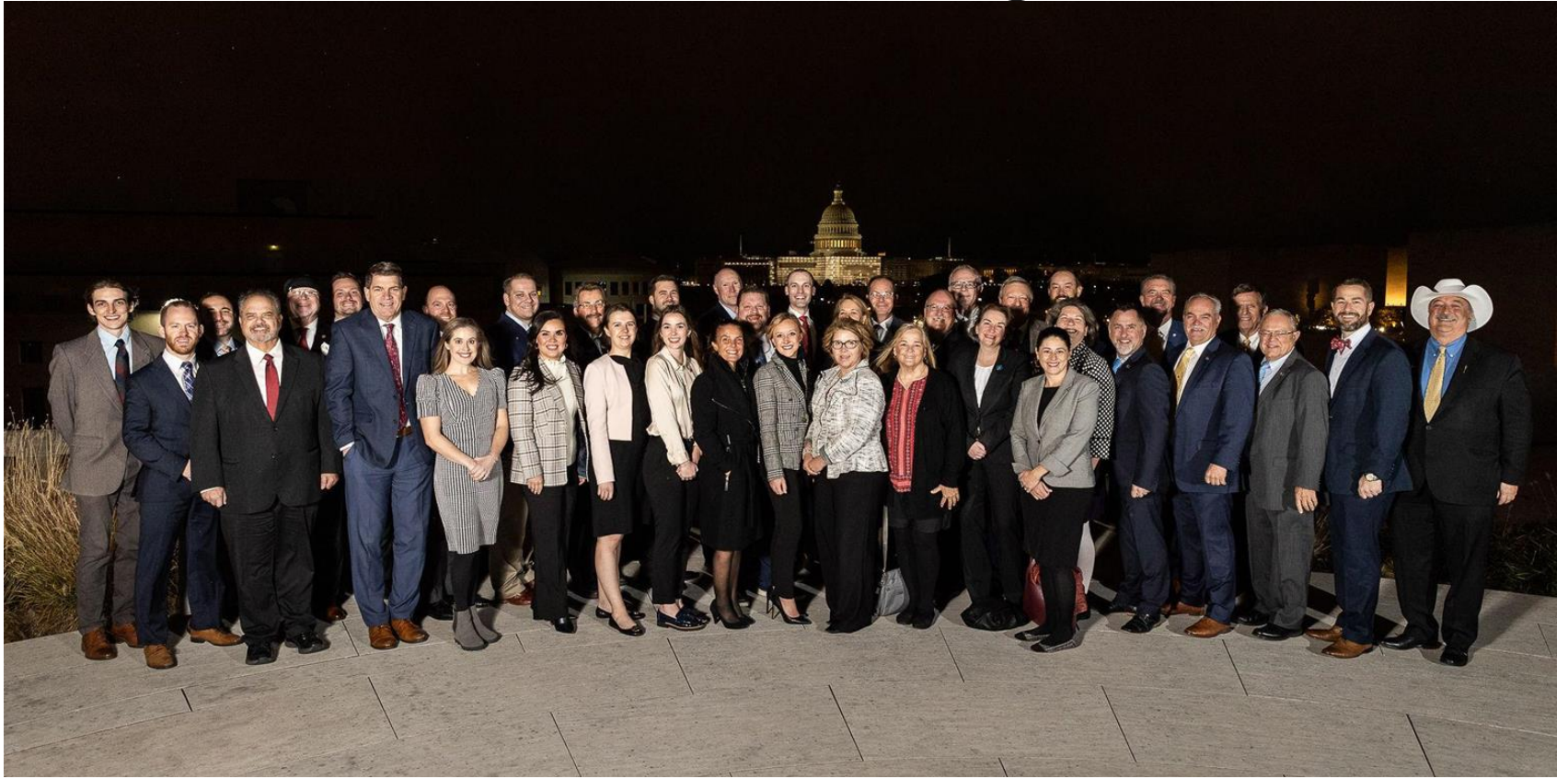
The LEHI graduating class at the Graduation Ceremony at the Embassy of Canada to the U.S. in Washington, D.C.