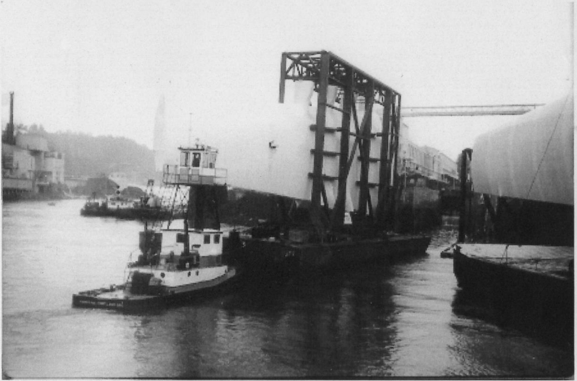
Spruce Goose Wings entering the West Linn, Oregon Locks in 1993.

Printed on paper Manufactured at the West Linn Paper Mill in 2004