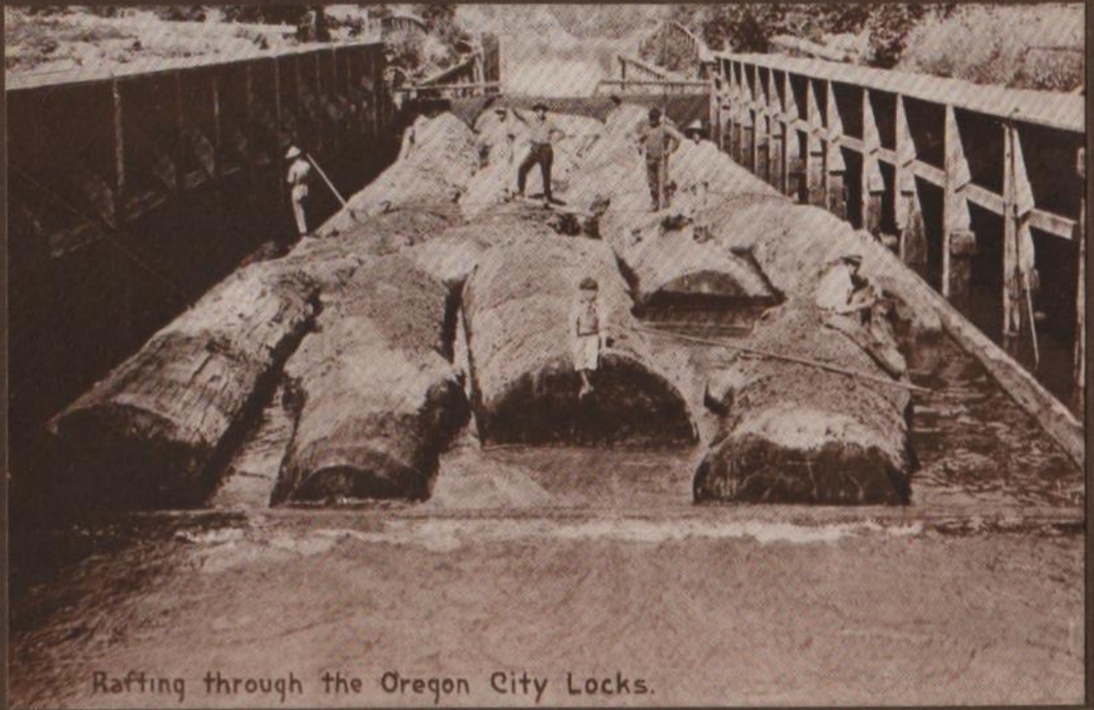
Rafting through the Oregon City Locks.