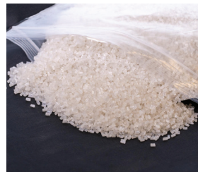
Upcycled glass fiber pellets