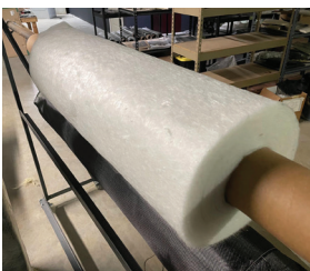
Upcycled glass fiber wet-laid mat