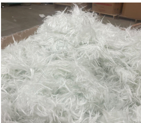
Upcycled shredded glass fiber

We have partnered with the Department of Energy and commercialized our technology so turbine blades will never have to be landfilled, and our upcycled glass fiber goes immediately into next-generation wind turbine manufacturing.