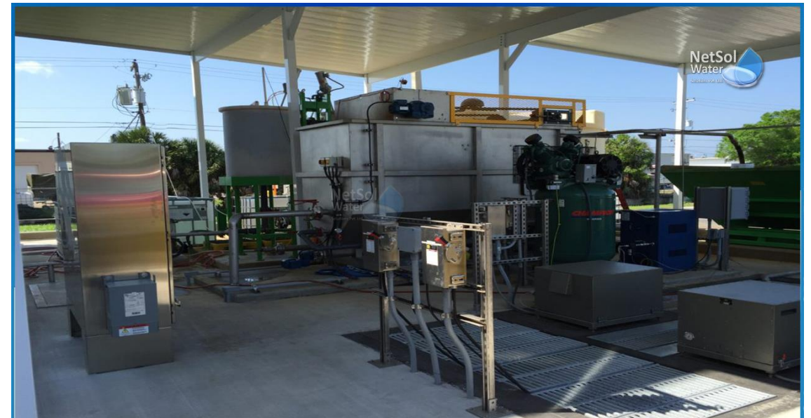
Industrial Wastewater Treatment in Food Industry