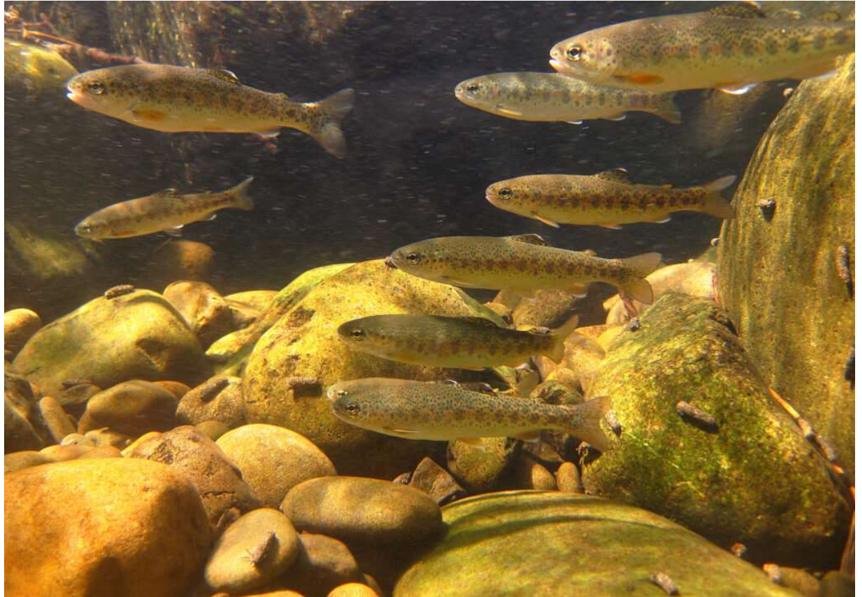
Juvenile steelhead / Oncorhynchus mykiss