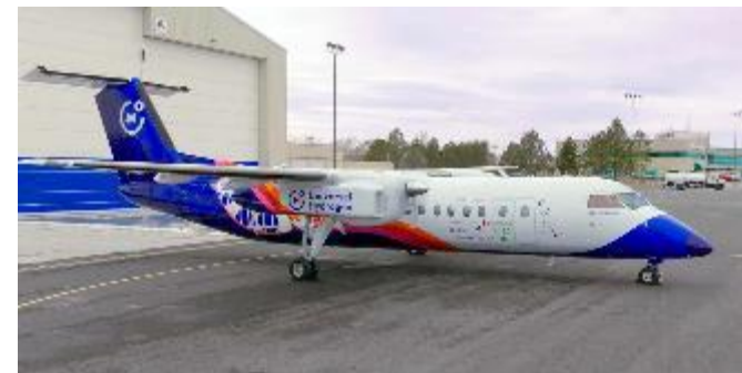
Universal Hydrogen ATR 72-600 Dash 8-300 40 pax Hydrogen cell electric March 2, 2023 First flight at Moses lake