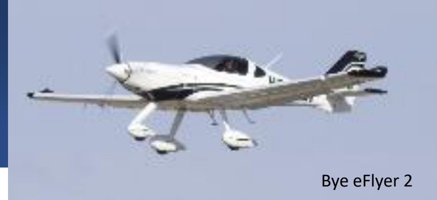
Bye eFlyer 2