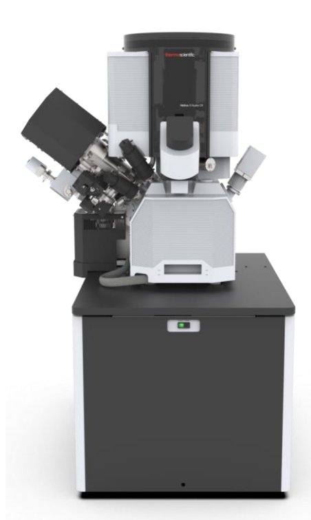
“Helios 5 Hydra DualBeam” Thermo Fisher Scientific