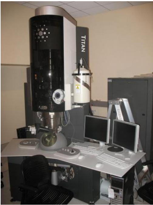
“FEI Titan 80-200 TEM/STEM with ChemiSTEM Capability” Oregon State University Electron Microscopy Facility