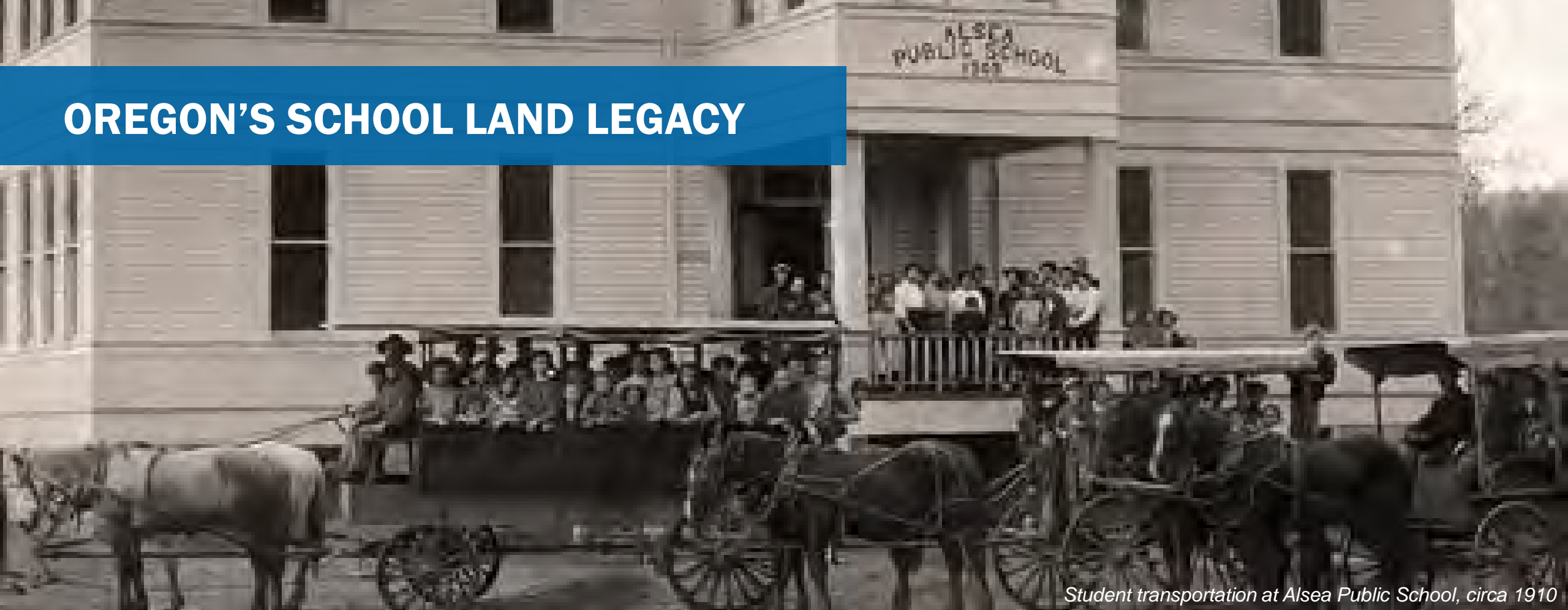
Student transportation at Alsea Public School, circa 1910