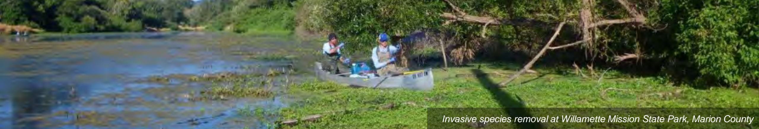
Invasive species removal at Willamette Mission State Park, Marion County