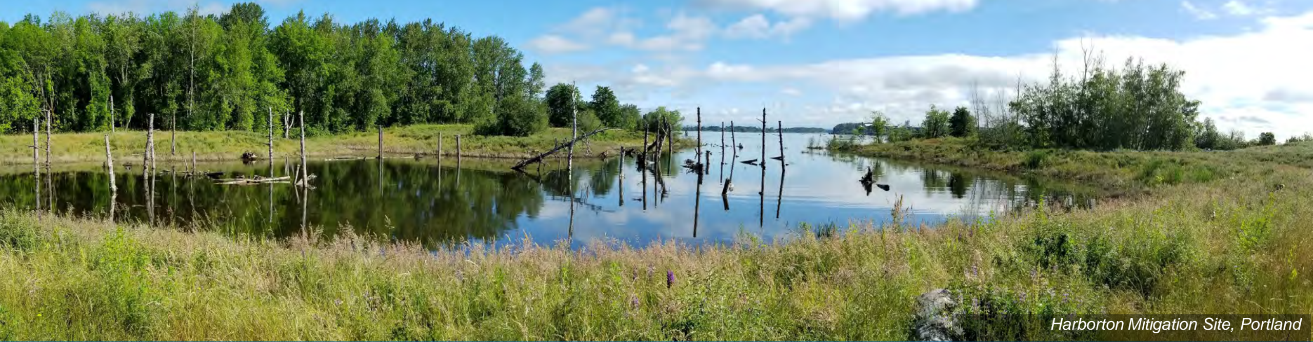
Harborton Mitigation Site, Portland