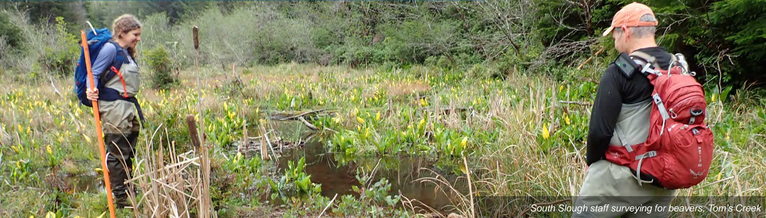
South Slough staff surveying for beavers, Tom's Creek