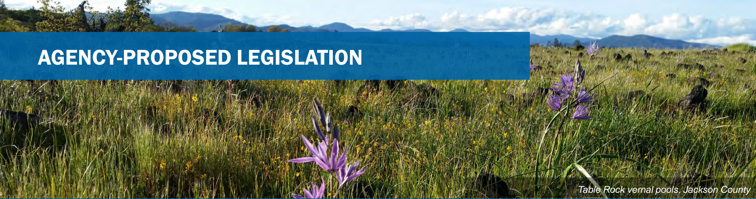
Table Rock vernal pools, Jackson County