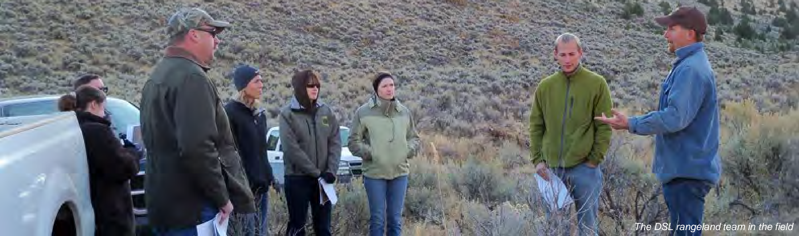
The DSL rangeland team in the field