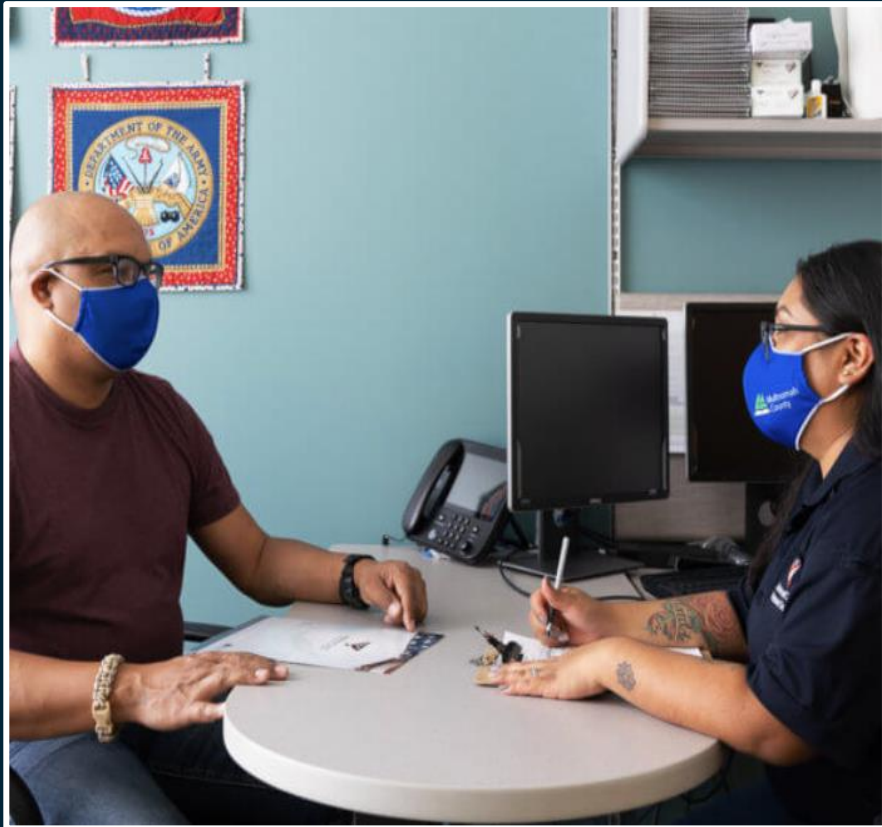
Multnomah County Veteran Service Office.