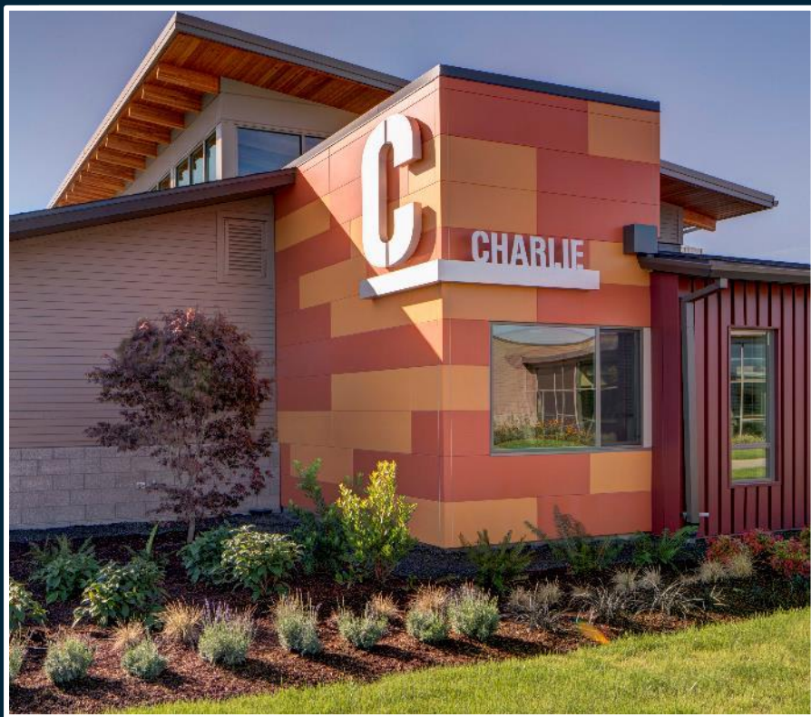
Oregon Veterans' Home – Lebanon.